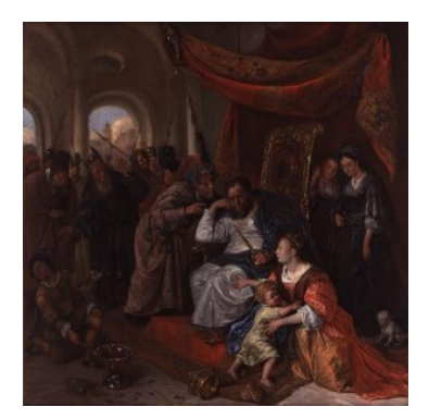
Fig 2. Jan Steen, Moses Trampling Pharaoh's Crown , ca. 1670, oil on canvas, 78 x 79 cm, Mauritshuis, The Hague