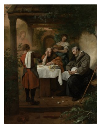
Fig 1. Jan Steen, Supper at Emmaus , ca. 1665–66, oil on canvas, 134 x 104 cm, Rijksmuseum, Amsterdam, SK-A-1932