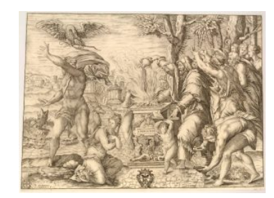
Fig 3. Nicolas Beatrizet, presumably after Francesco Salviati, The Sacrifice of Iphigenia , ca. 1553–55, engraving, 320 x 445 mm, British Museum, London, 1951,0407.80