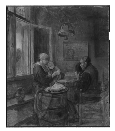
Fig 2. Infrared reflectogram of The Prayer Before the Meal , JS-116