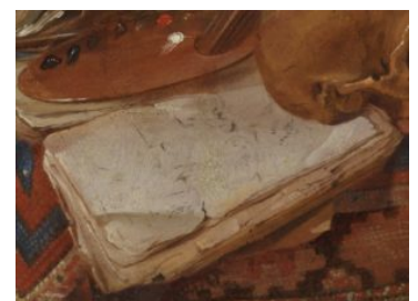
Fig 2. Detail of sketchbook in Jacob Toorenvliet, Allegory of Painting (JT-106)