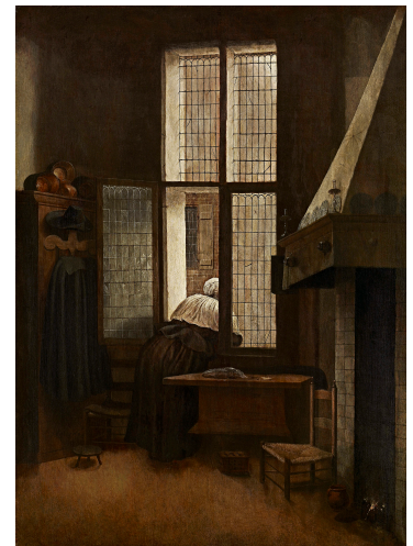
Fig 4. Left: Jacob Vrel, Woman Looking Out of a Window , 1654, oil on panel, 66 x 47.5 cm, Kunsthistorisches Museum, Gemäldegalerie, Vienna, inv. 6081; and right: Jacob Vrel, An Interior with a Sick Woman by a Fireplace (JV-100), 1928 photograph showing extended format