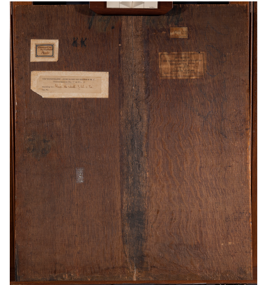
Fig 3. Left: reverse of Jacob Vrel, An Interior with a Sick Woman by a Fireplace (JV-100), and right: reverse of the panel in Vienna