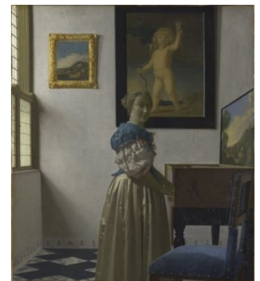
Fig 2. Johannes Vermeer, A Young Woman Standing at a Virginal , ca. 1670–72, oil on canvas, 51.7 x 45.2 cm, National Gallery, London, inv. no.