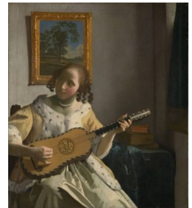
Fig 1. Johannes Vermeer, The Guitar Player , ca. 1670, oil on canvas, 53 x 46.3 cm, English Heritage, Kenwood House, London, inv. no. 88028841.