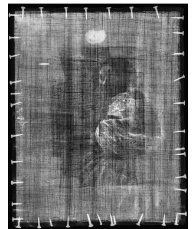
Fig 6. X-radiograph of Young Woman Seated at a Virginal , The Leiden Collection, New York.