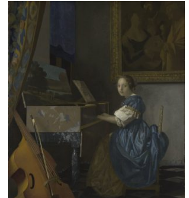
Fig 3. Johannes Vermeer, A Young Woman Seated at a Virginal , ca. 1673–75, oil on canvas, 51.5 x 45.5 cm, National Gallery, London, inv. no. NG2568, © National Gallery, London / Art Resource, NY.

1670–72, oil on canvas, 51.7 x 45.2 cm, National Gallery, London, inv. no. NG1383, © National Gallery, London / Art Resource, NY.