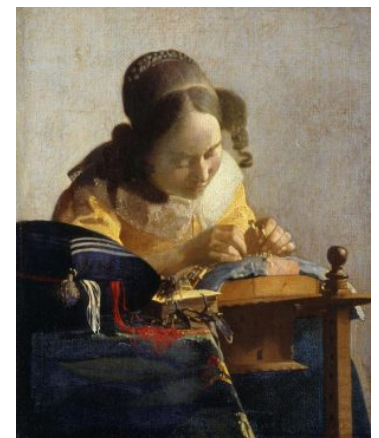
Fig 7. Johannes Vermeer, The Lacemaker , ca. 1669–71, oil on canvas, 24.5 x 21 cm, Musée du