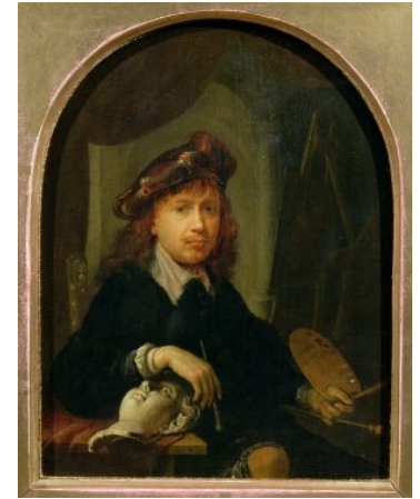
Fig 1. Gerrit Dou, Self-Portrait, ca. 1635–38, oil on panel, arched top, 18.3 x 14 cm, Cheltenham Art Gallery and Museum, 1899.1.25