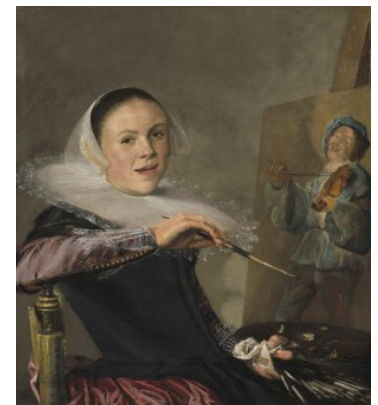
Fig 2. Judith Leyster, Self-Portrait , ca. 1630, oil on canvas, 74.6 x 65 cm, National Gallery of Art, Washington, 1949.6.1