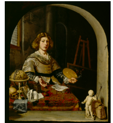
Fig 4. Cornelis Bisschop, The Artist in His Studio , ca. 1665–70, oil on canvas, 90.8 x 76.8 cm, Detroit Institute of Arts, Gift of Anna Scripps Whitcomb, 38.29

Portrait , 1668, oil on canvas, 117 x 98.6 cm, Dordrechts Museum, Dordrechts, DM/887/308