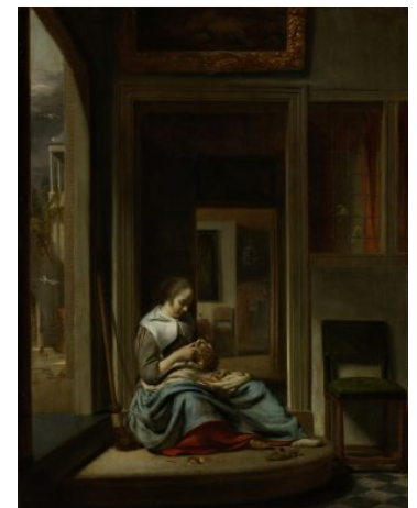
Fig 5. Cornelis Bisschop, Girl Peeling an Apple , 1667, oil on panel, 70 x 57 cm, Rijksmuseum, Amsterdam, SK-A-2110