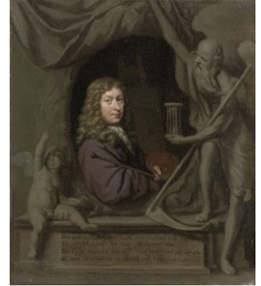
Fig 6. Michiel van Musscher, Self-Portrait , 1685, oil on canvas, 20.5 x 17.8 cm, Rijksmuseum, Amsterdam, inv. no. SK-A-4232