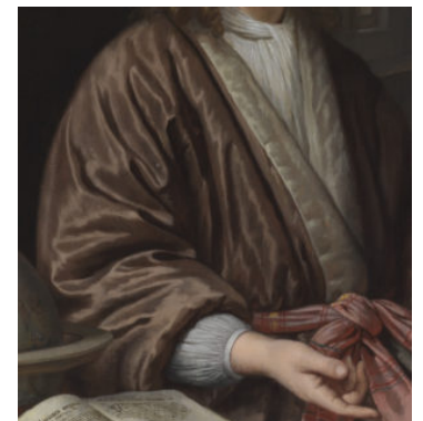
Fig 1. Detail of Michiel van Musscher, Portrait of the Artist in His Studio , MM-103, showing the right sleeve of the silk rok