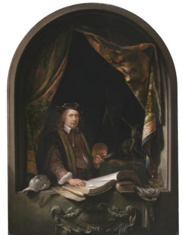
Fig 7. Gerrit Dou, Self-Portrait , ca. 1665, oil on panel, arched top, 59 x 43.5 cm, Rose-Marie and Eijk van Otterloo Collection, Boston