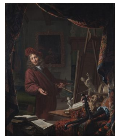
Fig 5. Michiel van Musscher, Self-Portrait , 1679 oil on panel, 56 x 46.5 cm, Het Schielandshuis, Rotterdam, inv. no. HMR 10567