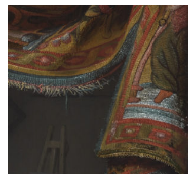
Fig 2. Detail of Michiel van Musscher, Portrait of the Artist in His Studio , MM-103, showing the tapestry