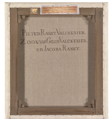
Fig 3. Reverse of MM-102.a revealing the inscription identifying the sitter. The original inscription on the old linen was reproduced in Mylar-encapsulated images and attached to the tops of the reverse, while the contents of the inscription was copied onto the relined canvas.