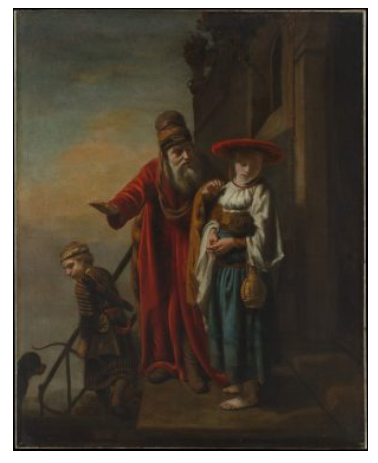
Fig 1. Nicolaes Maes, Abraham Dismissing Hagar and Ishmael , 1653, oil on canvas, 87.6 x 69.9 cm, New York, The Metropolitan Museum of Art, inv. no. 1971.73, www.metmuseum.org