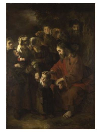
Fig 2. Nicolaes Maes, Christ Blessing the Children, ca. 1653, oil on canvas, 206 x 154 cm, London, National Gallery, inv. no. NG757