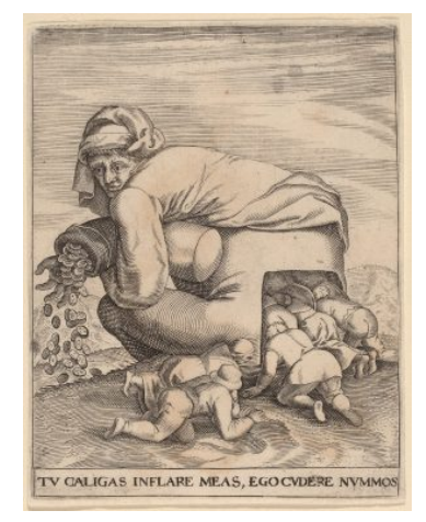
Fig 4. Jan Theodor de Bry, after Johannes Wierix, Man with the Money Bag and His Flatterers , engraving, 10.7 x 8.4 cm, National Gallery of Art, Washington D.C.