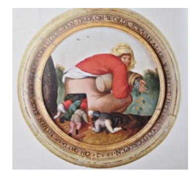
Fig 2. Pieter Brueghel the Younger, A Proverb: He who holds the sack of gold will always have flatterers , oil on panel, 18.2 cm diameter, whereabouts unknown (formerly, sale, Sotheby's, London, 12 July 2001, no. 118)