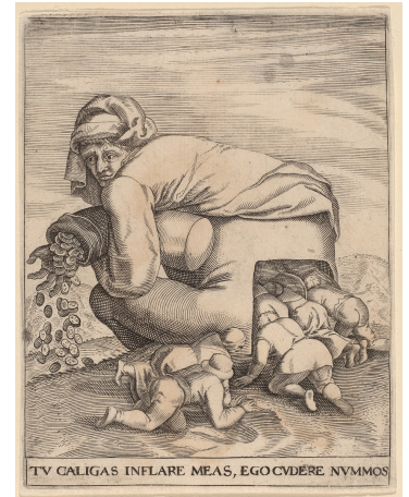
Fig 4. Jan Theodor de Bry, after Hieronymus Wiericx, Man with the Money Bag and His Flatterers , engraving, 10.7 x 8.4 cm, National Gallery of Art, Washington D.C.