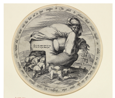
Fig 3. Hieronymus Wiericx, Man with the Moneybag and His Flatterers , ca. 1558, engraving, 17.8 cm diameter, Ashmolean Museum, Oxford, © Ashmolean Museum, University of Oxford