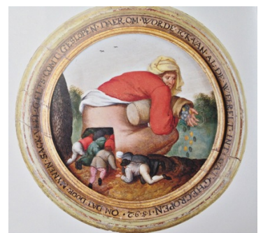
Fig 2. Pieter Brueghel the Younger, A Proverb: He who holds the sack of gold will always have flatterers , oil on panel, 18.2 cm diameter, whereabouts unknown (formerly, sale, Sotheby’s, London, 12 July 2001, no. 118)