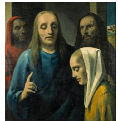
Fig 5. Han van Meegeren (forgery as a work by Johannes Vermeer), Christ and the Woman Taken in Adultery , ca. 1942, oil on canvas and mixed media, 100 x 90 cm, Collection Museum de Fundatie, Zwolle and Heino/Wijhe, the Netherlands, Loan from Cultural Heritage Agency of the Netherlands