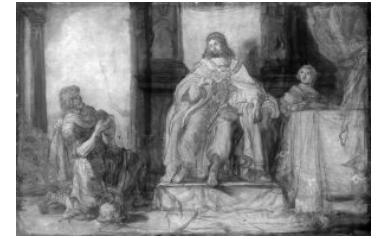
Fig 1. Infrared reflectogram of Pieter Lastman, David and Uriah , PL-100