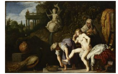
Fig 4. Pieter Lastman, The Bathing of Bathsheba , 1619, oil on panel, 42 x 63, The State Hermitage Museum, St. Petersburg, 5590

This exquisitely preserved painting is one of Lastman's finest works, not only in the characterization of the figures but also in the way the structural clarity of the composition reinforces the dramatic thrust and power of this narrative moment. One appreciates immediately in this work why two aspiring history painters from Leiden, namely Jan Lievens (1607–74) and Rembrandt van Rijn (1606–69), came to Amsterdam to study under this renowned master. Each of these artists remained indebted to Lastman's influence long after their periods of study (Lievens from around 1617–21 and Rembrandt for six months in 1625), with Rembrandt actually making a number of copies of Lastman's compositions in 1633, the year of that master's death.