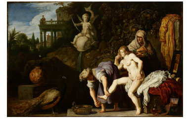
Fig 4. Pieter Lastman, The Bathing of Bathsheba , 1619, oil on panel, 42 x 63, The State Hermitage Museum, St. Petersburg, 5590

In 1619, the very year that Lastman painted this panel, he also painted The Bathing of Bathsheba ( fig 4 ). He may have intended the two paintings to be pendants, since both works are derived from the same biblical episode and are virtually identical in size. [6] The year 1619 marked a tragic event in Dutch history that may explain the artist's decision to paint this biblical subject. On 13 May, Johan van Oldenbarnevelt, once the great and heroic compatriot of William the Silent, was executed for high treason. His death shocked many in the Netherlands, since Van Oldenbarnevelt had served as the Land's Advocate of Holland, was instrumental in founding the United East India Company, and played a critical role in bringing about the Twelve Years' Truce. In 1618, however, Van Oldenbarnevelt fell out of political favor when he sided with the Remonstrants, a moderate branch of the Calvinist Church that supported the rights of each provincial government to determine its own religious doctrine. The stadholder Prince Maurits sided with the Anti-Remonstrants, a stricter fundamentalist branch of Calvinism that favored government protection and support of one official Reformed Church. Prince Maurits ordered Van Oldenbarnevelt's arrest and beheading, and subsequently consolidated all political and military might in the Dutch Republic. One can