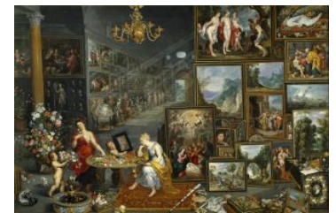
Fig 1. Peter Paul Rubens and Jan Brueghel the Elder, Sense of Sight , 1617, 64.7 x 109.5 cm, Museo del Prado, Madrid, inv. no. P01394