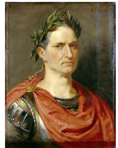
Fig 4. Peter Paul Rubens, Julius Caesar , 1619, oil on canvas, 69 x 52 cm, Stiftung Preußische Schlösser und Gärten Berlin-Brandenburg, Berlin, inv. no. GK I 972