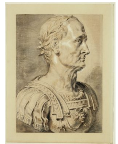
Fig 2. Peter Paul Rubens, Bust of Julius Caesar , ca. 1624, pen and brown ink over main drawing in black chalk, brown and gray washes, heightened with white, 262 x 190 mm, Musée du Louvre, Paris, Cabinet des Dessins, inv.