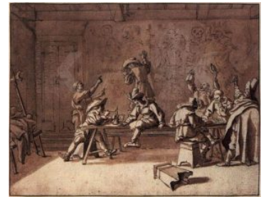
Fig 2. Pieter van Laer, The Bentveughels in a Roman Tavern , ca. 1630, brown ink and wash on paper, 20.3 x 25.8 cm, Kupferstichkabinet, Staatliche Museen zu Berlin, inv. 5239