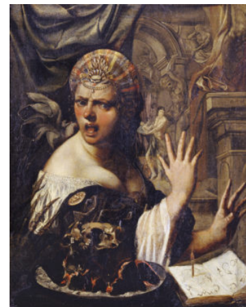
Fig 4. Angelo Caroselli, La Negromante , ca. 1625, oil on canvas, 44 x 35 cm, Pinacoteca Civica "F. Podesti" – Ancona

Damned Soul , 1619, marble, Palazzo di Spagna, Rome