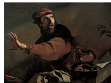
Fig 5. Pietro Paolini, Negromante , ca. 1630, oil on canvas, 70 x 93 cm, Collezione Cavallini Sgarbi, Ferrara