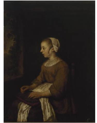
Fig 2. Philips Koninck, The Young Seamstress , 1671, oil on canvas, 25.5 × 20 cm, The State Hermitage Museum, St. Petersburg, inv. 628

Rembrandt's interest in rendering this woman's face in indirect light may relate to an artistic challenge he was facing around 1640 in planning his double portrait of Cornelis Claesz Anslo and his wife of 1641 ( fig 3 ). The interaction of these two conversing figures required that one face would be cast in shadow—in this case, the man's—while the other was lit. In both works Rembrandt sought to balance a convincing rendering of the effect of strong light with a wide range of modulated shadows and reflected light. These