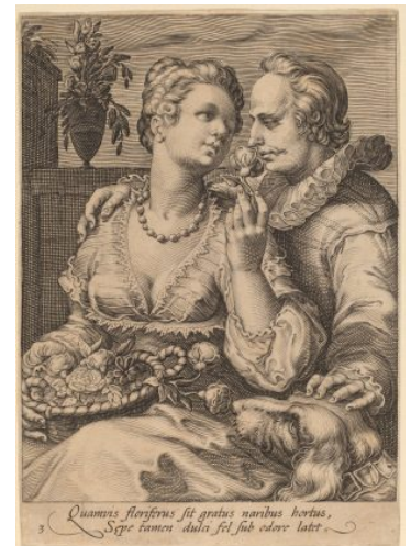
Fig 11. Jan Saenredam after Hendrick Goltzius, The Sense of Smell , ca. 1595, engraving, 173 x 123 mm, National Gallery of Art, Washington D.C., Rosenwald Collection, 1943.3.4640