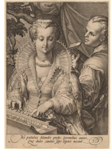
Fig 10. Jan Saenredam after Hendrick Goltzius, The Sense of Hearing , ca. 1595, engraving, 173 x 123 mm, National Gallery of Art, Washington D.C., Rosenwald Collection, 1943.3.4640