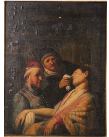
Fig 1. Rembrandt van Rijn, Unconscious Patient (Allegory of Smell) , RR-111 (panel with eighteenth-century additions before restoration)