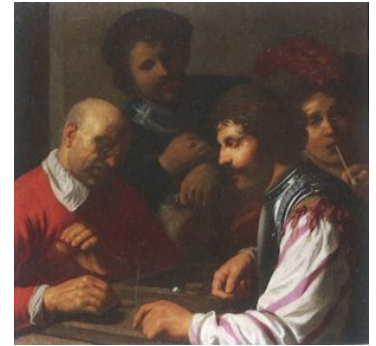
Fig 15. Jan Lievens, Tric Trac Players , 1624/25, oil on panel, 98 x 106 cm, Spier Collection, London