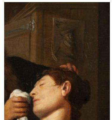
Fig 5. Signature detail, Rembrandt van Rijn, Unconscious Patient (Allegory of Smell) , ca. 1624–25, oil on panel, 21.5 x 17.7 cm, The Leiden Collection, New York, inv. no. RR-111.