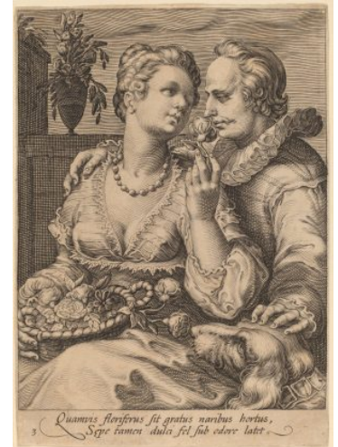
Fig 11. Jan Saenredam after Hendrick Goltzius, The Sense of Smell , ca. 1595, engraving, 173 x 123 mm, National Gallery of Art, Washington D.C., Rosenwald Collection, inv. no. 1943.3.4640.