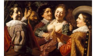
Fig 14. Jan Lievens, Allegory of the Five Senses , ca. 1622, oil on panel, 78.2 x 124.4 cm, private collection.