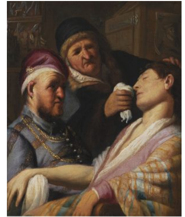
Fig 6. Rembrandt van Rijn, Unconscious Patient (Allegory of Smell) , without eighteenth-century additions (after restoration), ca. 1624–25, oil on panel, 21.5 x 17.7 cm, The Leiden Collection, New York, inv. no. RR-111.

Just how Rembrandt devised the various scenes in his series of the Five Senses , and the sequence in which he intended them to be viewed, is not known. Nevertheless, it is clear that with the exception of Allegory of Smell , the young master loosely followed long-established iconographic traditions for his compositional inventions. For example, a number of sixteenth-century artists based their depictions of the Allegory of Touch on Lucas van Leyden's The Stone Operation . [18] As discussed above, Allegory of Hearing often showed young lovers playing musical instruments. There is no precedent, however, for connecting Allegory of Smell to bloodletting. Quite to the contrary, artists like Hendrick Goltzius depicted The Sense of Smell in a