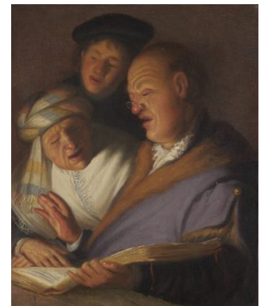
Fig 2. Rembrandt van Rijn, Three Musicians (Allegory of Hearing) , ca. 1624–25, oil on panel, 21.5 x 17.7 cm, The Leiden Collection, New York, inv. no. RR-105.