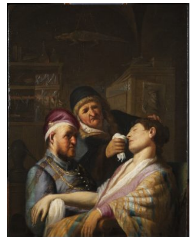
Fig 7. Rembrandt van Rijn, Unconscious Patient (Allegory of Smell) , with eighteenth-century additions (after restoration), ca. 1624–25, oil on panel, 31.8 x 25.4 cm, The Leiden Collection, New York, inv. no. RR-111.