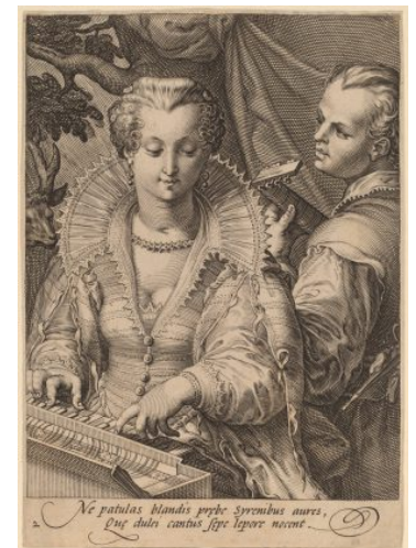
Fig 10. Jan Saenredam after Hendrick Goltzius, The Sense of Hearing , ca. 1595, engraving, 173 x 123 mm, National Gallery of Art, Washington D.C., Rosenwald Collection, inv. no. 1943.3.4640.