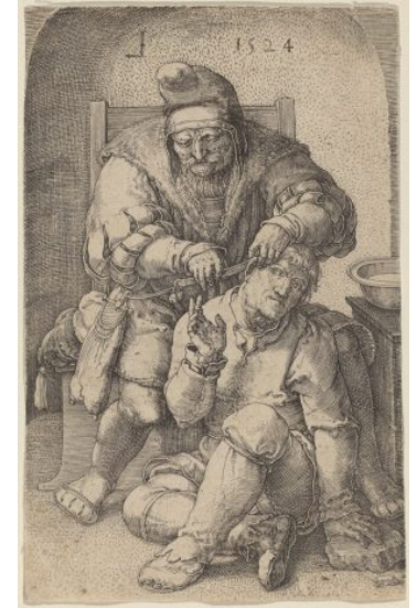
Fig 9. Lucas van Leyden, The Surgeon , 1524, etching, 117 x 76 mm, National Gallery of Art, Gift of the Estate of Leo Steinberg, inv. no. 2011.139.35

Hercules and his Family in his Barbershop , 1669, oil on canvas, 70 x 59 cm, Amsterdam Museum, Amsterdam, inv. no. SA 2121.