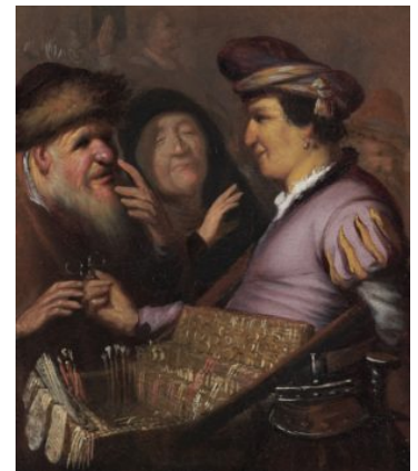
Fig 4. Rembrandt van Rijn, Spectacles Seller (Allegory of Sight) , ca. 1624, oil on panel 21 x 17.8 cm, Museum De Lakenhal, Leiden, inv. no. S 5697