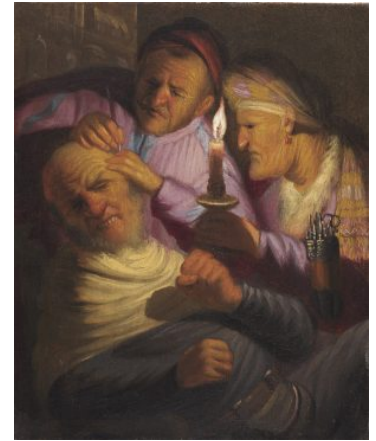
Fig 3. Rembrandt van Rijn, Stone Operation (Allegory of Touch) , ca. 1624–25, oil on panel, 21.5 x 17.7 cm, The Leiden Collection, New York, inv. no. RR-102.

Patients being bled were generally portrayed with their lower arm exposed, exactly as in the image of another bloodletting ( fig 8 ). [12] Once pricked with a lancet (a two-edged surgical knife or blade with a sharp point), the blood would drip into a bowl often held by an assistant. Occasionally patients would faint at the end of a bloodletting, a condition deemed to indicate the treatment's success. Here, however, one sees neither wound nor blood, neither bandage nor bowl, which means that the young man has not fainted in reaction to such a session, but in anticipation of it. Rembrandt's image, indeed, not only mocks the elderly woman's excessive concern