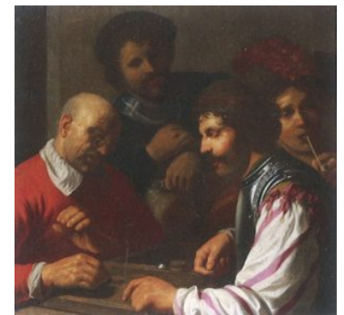
Fig 15. Jan Lievens, Tric Trac Players , 1624/25, oil on panel, 98 x 106 cm, Spier Collection, London.