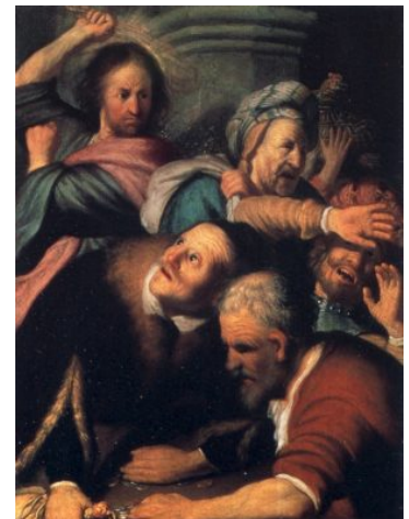
Fig 12. Rembrandt van Rijn, Christ Driving the Money-Changers from the Temple , 1626, oil on panel, 44 x 33 cm, Pushkin Museum, Moscow, inv. no. F-1900.