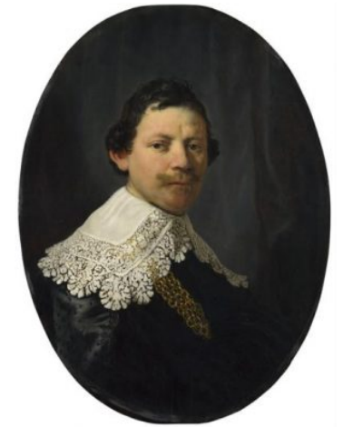
Fig 2. Rembrandt van Rijn, Portrait of Philip Lucasz , 1635, oil on panel, The National Gallery, London, inv. no. NG 850