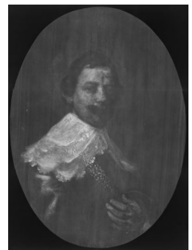
Fig 3. Rembrandt van Rijn, Portrait of Philips Lucasz , X-ray, 1635, oil on panel, The National Gallery, London, NG 850