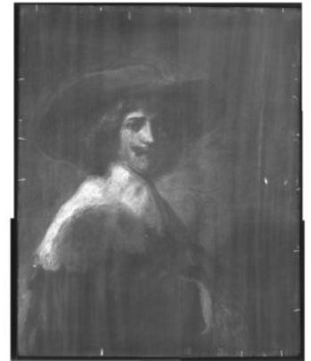
Fig 4. X-radiograph of RR-103

During the early to mid-1630s, artists who had previously been trained