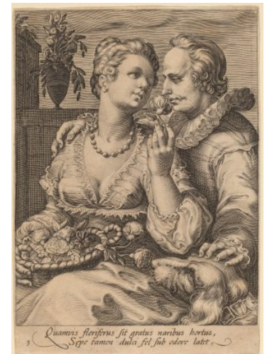
Fig 11. Jan Saenredam after Hendrick Goltzius, The Sense of Smell , ca. 1595, engraving, 173 x 123 mm, National Gallery of Art, Washington D.C., Rosenwald Collection, 1943.3.4640