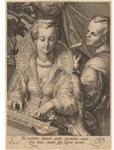
Fig 10. Jan Saenredam after Hendrick Goltzius, The Sense of Hearing , ca. 1595, engraving, 173 x 123 mm, National Gallery of Art, Washington D.C., Rosenwald Collection, 1943.3.4640