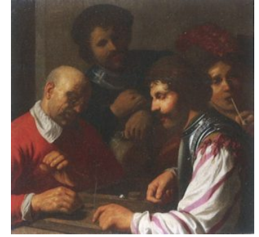
Fig 15. Jan Lievens, Tric Trac Players , 1624/25, oil on panel, 98 x 106 cm, Spier Collection, London

At the time that Rembrandt executed The Leiden Collection's panels, Lievens had been painting independently in Leiden for nearly four years. Jan Orlers, who knew Lievens well, records that the young artist returned from his apprenticeship with Pieter Lastman in 1621. Nevertheless, Lievens probably continued his training in Utrecht, since his paintings from 1622–24 fully reflect the latest artistic achievements of Van Honthorst and the other Utrecht Caravaggisti. [38] Rembrandt completed his own three-year