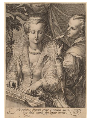
Fig 10. Jan Saenredam after Hendrick Goltzius, The Sense of Hearing , ca. 1595, engraving, 173 x 123 mm, National Gallery of Art, Washington D.C., Rosenwald Collection, inv. no. 1943.3.4640.