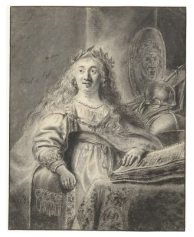
Fig 1. Attributed to Ferdinand Bol, copy after Rembrandt's Minerva in Her Study , ca. 1636, pen and brush in gray ink, black chalk, 257 x 202 mm, Rijksprentenkabinet, Rijksmuseum, Amsterdam, RP-T-1975-85