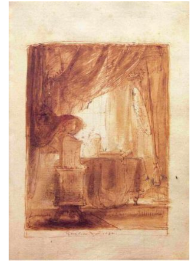
Fig 7. Rembrandt van Rijn, Minerva in Her Study , 1652, pen and brown ink, brown and white wash, 190 x 140 mm, Six Collection, Amsterdam

Rembrandt's choice to revisit the theme of the peaceful Minerva might have been related to the political situation of the Dutch Republic at that time. In 1635, the same year that Rembrandt completed this painting, the States General, under the leadership of Frederik Hendrik, decided that the Dutch Republic should join forces with France