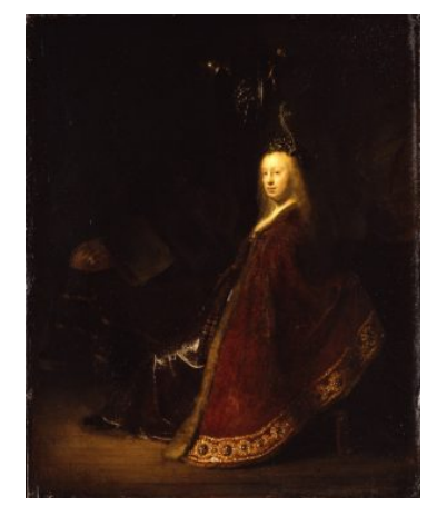
Fig 6. Rembrandt van Rijn, Minerva in Her Study , ca. 1631, oil on panel, 60.5 x 49 cm, Gemäldegalerie, Berlin, Staatliche Museen zu Berlin, inv. 828c