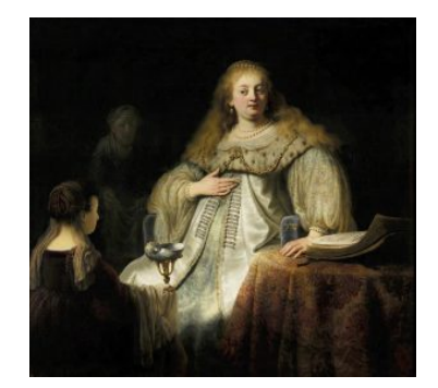
Fig 4. Rembrandt van Rijn, Artemisia (or Sophonisba?), [also known as Judith at the Banquet of Holofernes], 1634, oil on canvas, 143 x 154.7 cm,