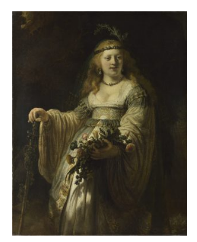
Fig 2. Rembrandt van Rijn, Flora ( Saskia van Uylenburgh in Arcadian Costume ), 1635, oil on canvas, 123.5 x 97.5 cm, National Gallery, London, Bought with contributions from The Art Fund, 1938, inv. NG4930, © National Gallery, London / Art Resource, NY

Probably because it was so rarely on view before 2002, Minerva in Her Study played a relatively modest role in earlier publications on Rembrandt. Its attribution to Rembrandt was sometimes doubted, and it was even proposed that the painting was the result of a collaboration between Rembrandt and his pupil Ferdinand Bol (1616–80).<sup>[5]</sup> The latter suggestion was based on the existence of a faithfully drawn copy of the composition signed "F. Bol" (Rijksmuseum, Amsterdam) ( fig 1 ). Although the signature is probably false, Bol likely made this copy shortly after he entered Rembrandt's studio in 1636.<sup>[6]</sup> Comparable albeit more skillfully drawn copies attributed to Bol also exist of the Rembrandt's Flora ( Saskia van Uylenburgh in Arcadian Costume ) of 1635 (National Gallery, London) ( fig 2 ) and his Standard-Bearer of 1636 (private collection, Paris).<sup>[7]</sup> The production of drawn copies after the works of the master was a common workshop practice. Rembrandt, according to a