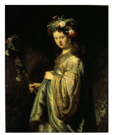
Fig 5. Rembrandt van Rijn, Portrait of Saskia in the Guise of Flora , 1635, oil on canvas, 123.5 x 97.5 cm, The State Hermitage Museum, St. Petersburg

The evolution of Rembrandt's approach in these works is revealing. The figure of Bellona is somewhat formidable in appearance and shows weaknesses in execution, but it is the first instance in which Rembrandt developed this interest in strong threedimensional effects.<sup>[16]</sup> Flora (Saskia van Uylenburgh in Arcadian Costume) of 1635 is more successful as a work of art as Rembrandt executed it with assured brushstrokes and a subdued palette of cooler and warmer tints. Moreover, in that work he placed the brightly illuminated figure against a dark background to create a strong suggestion of depth. Most comparable to Minerva in Her Study is Artemisia of 1634. Both paintings depict an opulently dressed blonde woman seated at a table and looking up from the book she is reading. Both of these dramatically lit figures are set off against a dark background and share a similar subtle color scheme of creams and grays and a