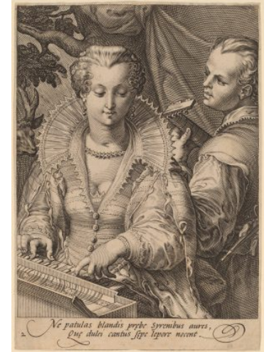
Fig 10. Jan Saenredam after Hendrick Goltzius, The Sense of Hearing , ca. 1595, engraving, 173 x 123 mm, National Gallery of Art, Washington D.C., Rosenwald Collection, 1943.3.4640