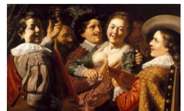
Fig 14. Jan Lievens, Allegory of the Five Senses , ca. 1622, oil on panel, 78.2 x 124.4 cm, private collection