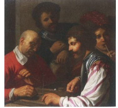
Fig 15. Jan Lievens, Tric Trac Players , 1624/25, oil on panel, 98 x 106 cm, Spier Collection, London

At the time that Rembrandt executed The Leiden Collection's panels, Lievens had been painting independently in Leiden for nearly four years. Jan Orlers, who knew Lievens well, records that the young artist returned from his apprenticeship with Pieter Lastman in 1621. Nevertheless, Lievens probably continued his training in Utrecht, since his paintings from 1622–24 fully reflect the latest artistic achievements of Van Honthorst and the other Utrecht Caravaggisti. [38] Rembrandt completed his own three-year