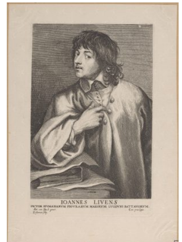
Fig 13. Lucas Vorsterman, after Sir Anthony van Dyck, Portrait of Jan Lievens , c. 1632, engraving, 24.1 x 15.8 cm., from the Iconography , National Gallery of Art, Washington