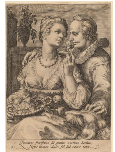
Fig 11. Jan Saenredam after Hendrick Goltzius, The Sense of Smell , ca. 1595, engraving, 173 x 123 mm, National Gallery of Art, Washington D.C., Rosenwald Collection, 1943.3.4640