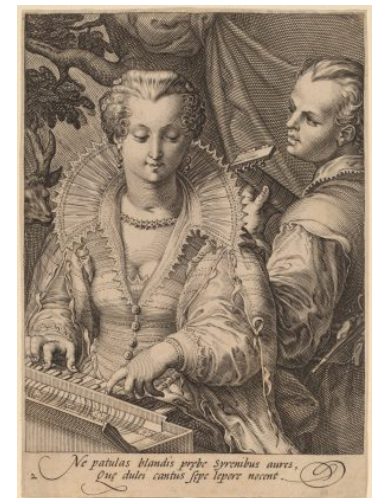
Fig 10. Jan Saenredam after Hendrick Goltzius, The Sense of Hearing , ca. 1595, engraving, 173 x 123 mm, National Gallery of Art, Washington D.C., Rosenwald Collection, inv. no. 1943.3.4640.