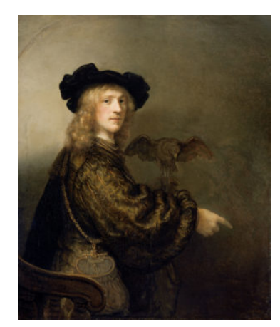
Fig 5. Rembrandt van Rijn and Workshop, Man with a Hawk , 1643, oil on canvas, 114 x 97.3 cm, Private Collection