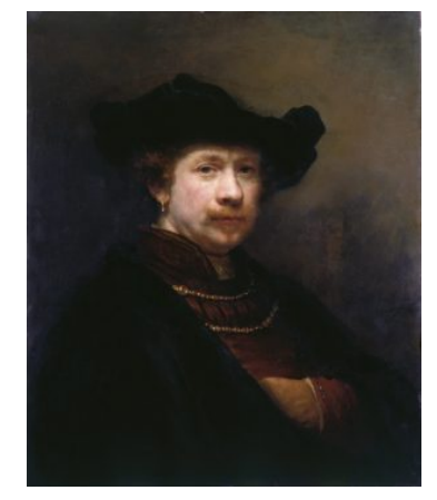
Fig 8. Rembrandt van Rijn, Self-Portrait in a Flat Cap , 1642, 70.4 x 58.8 cm, inv. no. RCIN 404120