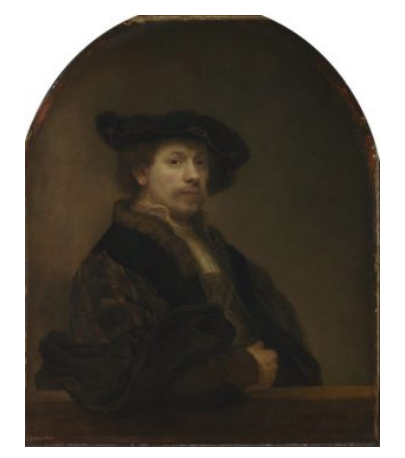
Fig 7. Rembrandt van Rijn, Self-Portrait at Age 34, 1640, oil on canvas, 102 x 80 cm, National Gallery, London, inv. no. NG672

The imaginative alteration of Man with a Sword 's attire links this work to the pictorial tradition of historicizing tronies that Rembrandt executed over the course of his career. Combinations of a beret or bonnet, jerkin, cape, and gold chain, which are derived from sixteenth-century fashions, already appeared in Rembrandt's work in the 1620s.<sup>[20]</sup> He used these motifs again in his self-portraits in the early 1640s, such as the Self-Portrait at the National Gallery in London from 1640 (fig 7), and the Self-Portrait at Windsor Castle from 1642 (fig 8). Although Man with a Sword does not portray Rembrandt himself—despite the assertions of many nineteenth-