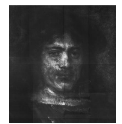
Fig 4. X-radiograph, detail of face, Man with a Sword