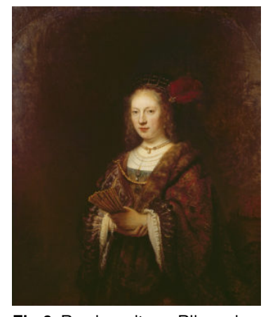
Fig 6. Rembrandt van Rijn and Workshop, Woman with a Fan , 1643, oil on canvas, 114.5 x 98 cm, Private Collection/Bridgeman Images