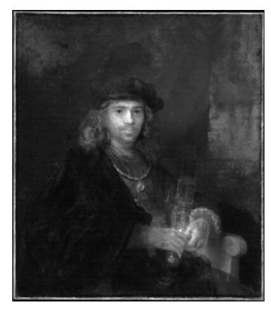
Fig 1. Infrared reflectography of Man with a Sword , 2013, Art Analysis & Research, London