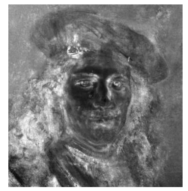
Fig 2. XRF scan of iron (FeK), detail of face, Man with a Sword