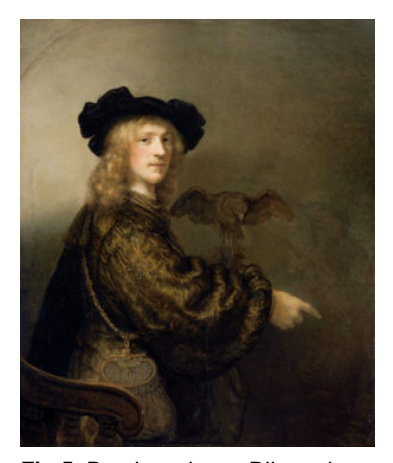
Fig 5. Rembrandt van Rijn and Workshop, Man with a Hawk , 1643, oil on canvas, 114 x 97.3 cm, Private Collection