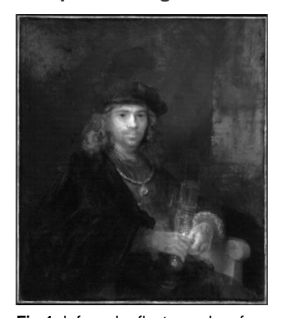
Fig 1. Infrared reflectography of Man with a Sword , 2013, Art Analysis & Research, London