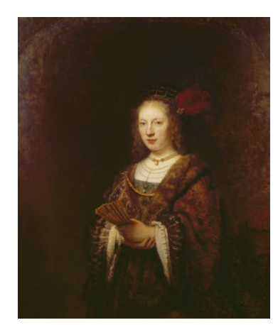
Fig 6. Rembrandt van Rijn and Workshop, Woman with a Fan , 1643, oil on canvas, 114.5 x 98 cm, Private Collection/Bridgeman Images