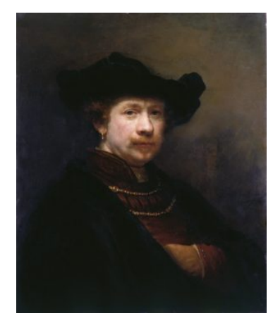
Fig 8. Rembrandt van Rijn, Self-Portrait in a Flat Cap, 1642, 70.4 x 58.8 cm, inv. no. RCIN 404120, Royal Collection Trust / © Her Majesty Queen Elizabeth II 2018