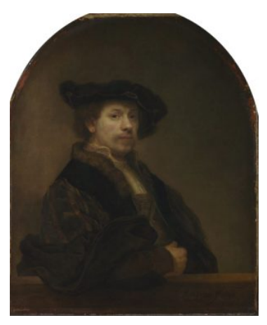
Fig 7. Rembrandt van Rijn, Self-Portrait at Age 34, 1640, oil on canvas, 102 x 80 cm, National Gallery, London, inv. no. NG672

Understanding the period of Rembrandt's career in which Man with a Sword