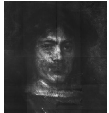
Fig 4. X-radiograph, detail of face, Man with a Sword , Simon Howell, Shepherd Conservation, London