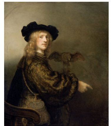
Fig 5. Rembrandt van Rijn and Workshop, Man with a Hawk , 1643, oil on canvas, 114 x 97.3 cm, Private Collection