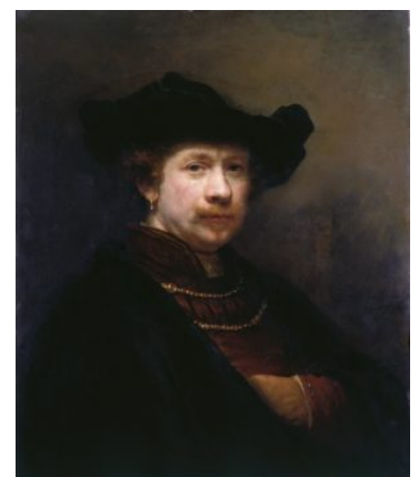
Fig 8. Rembrandt van Rijn, Self-Portrait in a Flat Cap , 1642, 70.4 x 58.8 cm, inv. no. RCIN 404120, Royal Collection Trust / © Her Majesty Queen Elizabeth II 2018