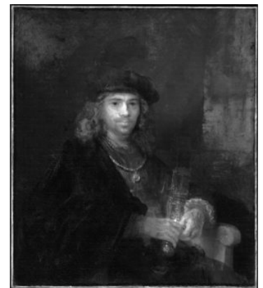
Fig 1. Infrared reflectography of Man with a Sword , 2013, Art Analysis & Research, London