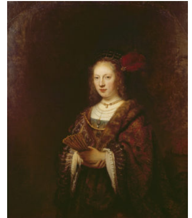
Fig 6. Rembrandt van Rijn and Workshop, Woman with a Fan, 1643, oil on canvas, 114.5 x 98 cm

The imaginative alteration of Man with a Sword ’s attire links this work to the pictorial tradition of historicizing tronies that Rembrandt executed over the course of his career. Combinations of a beret or bonnet, jerkin, cape, and gold chain, which are derived from sixteenth-century fashions, already appeared in Rembrandt’s work in the 1620s. [20] He used these motifs again in his self-portraits in the early 1640s, such as the Self-Portrait at the National Gallery in London from 1640 (fig 7), and the Self-Portrait at Windsor Castle from 1642 (fig 8). Although Man with a Sword does not