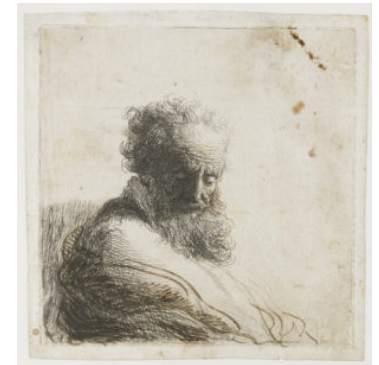
Fig 2. Rembrandt van Rijn, Old Man with Beard Facing Downwards, Three Quarters, to the Right , 1631, etching with annotations in pen, 120 x 118 mm, Rijksmuseum, Amsterdam, inv. no. RP-P-1959-667.