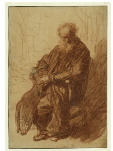
Fig 1. Rembrandt van Rijn, Old Man Seated with Folded Hands , ca. 1631, black and red chalk on reddish-yellow washed paper, incised, 226 x 157 mm, Kupferstichkabinett, Staatliche Museen, Berlin, Germany, inv. no. KDZ 1151

Bust of a Bearded Old Man is Rembrandt's smallest known painting, and the only grisaille by the artist in private hands. [1] The deep resonance it carries for the beholder arises from an extraordinary paradox: its size—it fits in the palm of one's