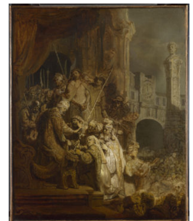
Fig 3. Rembrandt van Rijn, Ecce Homo , 1634, oil on paper mounted onto canvas, 54.4 x 44.5 cm, National Gallery, London, bought 1894, inv. no. NG1400, © National Gallery, London / Art Resource, NY.