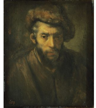
Fig 2. After Rembrandt van Rijn, Bust of a Man with a Fur Hat , 1640s–1650s, oil on panel, 21.3 x 18 cm, Gemäldegalerie Alte Meister, Museumslandschaft Hessen Kassel, no. 248

For Rembrandt's pupils the evocation of emotion in the model's features would have been an important element to study and capture in paint. One may even suggest that this sitter projects a state of inner turmoil, a quality that seems to be suggested by the purported identification of the sitter in Van Hoogstraten's print. An inscription at the upper left identifies the man as Jan van Leyden (1509?–36), the charismatic Dutch Anabaptist leader who