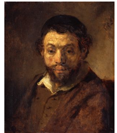
Fig 3. Rembrandt van Rijn, Portrait Study of a Young Jew , ca. 1648, oil on panel, 25.5 x 21.3 cm, Staatliche Museen zu Berlin, Gemäldegalerie, Berlin, inv. 828M, © Foto: Gemäldegalerie der Staatlichen Museen zu Berlin – Preußischer Kulturbesitz, Fotograf/in: Jörg P. Anders