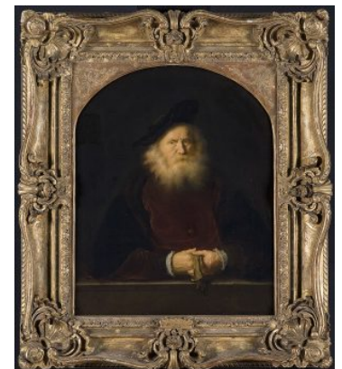
Fig 1. Salomon Koninck, A Bearded Old Man in a Beret, at a Balustrade, Holding His Gloves , 1650, oil on panel, 57 × 46.5 cm, Stichting Nederlands Kunstbezit, 1973, Instituut Collectie Nederland, The Hague, inv. NK 2694