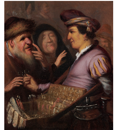
Fig 4. Rembrandt van Rijn, Spectacles Seller (Allegory of Sight) , ca. 1624 oil on panel 21 x 17.8 cm (8 1/4 x 7 in Museum De Lakenhal, Leiden, S 5697

Allegory of Smell features a young man wearing a colorful, loosely-draped housecoat, who has fainted and is slumped in a chair. An extremely worried old woman wearing a fur-trimmed hooded mantle tries to revive him by holding a white handkerchief to his nose, presumably one containing smelling salts. [9] An equally old man, his right hand covered by a white cloth, holds the youth's bare right forearm and anxiously awaits to see if the woman's efforts succeed. His colorful wardrobe, earring and gold chains, as well as the knives, scissors, razors and lotions displayed in a large wooden cupboard, identify him as a barber-surgeon, a profession renowned for its quacks. [10] The position of the young man's exposed