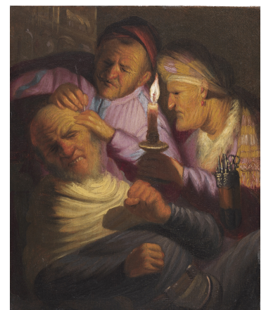
Fig 3. Rembrandt van Rijn, Stone Operation (Allegory of Touch) , RR-102