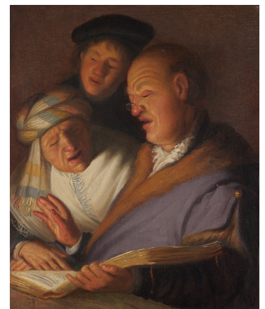
Fig 2. Rembrandt van Rijn, Three Musicians (Allegory of Hearing) , RR-105