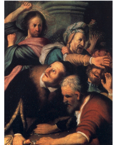
Fig 12. Rembrandt van Rijn, Christ Driving the Money-Changers from the Temple , 1626, oil on panel, 44 x 33 cm, Pushkin Museum, Moscow, F-1900.

The awkward characteristics of Stone Operation (Allegory of Touch) and Three Musicians (Allegory of Hearing) troubled many later scholars, and the attribution of these works to Rembrandt was a matter of much dispute until the early 1980s. For example, in 1956, Knuttel rejected the attribution to Rembrandt, and Rosenberg concluded that the paintings were "odd copies after Rembrandt." [23] Bauch proposed that they were the work of a