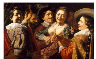
Fig 14. Jan Lievens, Allegory of the Five Senses , ca. 1622, oil on panel, 78.2 x 124.4 cm, private collection