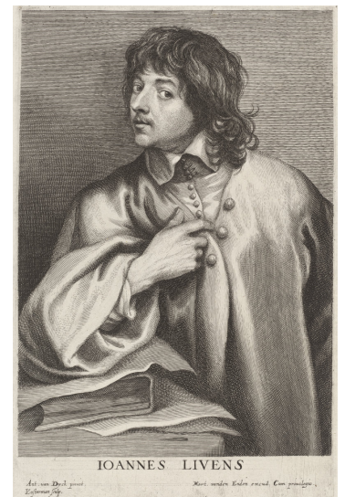
Fig 13. Lucas Vorsterman, after Sir Anthony van Dyck, Portrait of Jan Lievens , c. 1632, engraving, 24.1 x 15.8 cm., from the Iconography , National Gallery of Art, Washington