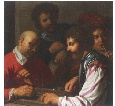
Fig 15. Jan Lievens, Tric Trac Players , 1624/25, oil on panel, 98 x 106 cm, Spier Collection, London

In 2006 Bernhard Schnackenburg revisited the hypothesis that the paintings should date to the early 1620s rather than the period after his six-month apprenticeship in 1626 with Pieter Lastman (1583–1633). Schnackenburg noted that the paintings reflect an unrestrained artistic personality, “one in need of practice but willing to take a risk.” [34] Van