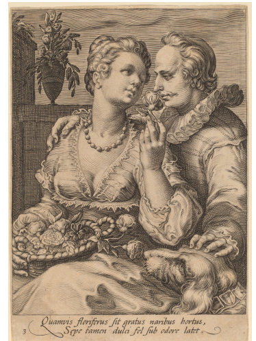
Fig 11. Jan Saenredam after Hendrick Goltzius, The Sense of Smell , ca. 1595, engraving, 173 x 123 mm, National Gallery of Art, Washington D.C., Rosenwald Collection, 1943.3.4640