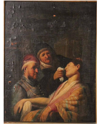
Fig 1. Rembrandt van Rijn, Unconscious Patient (Allegory of Smell) , RR-111 (panel with eighteenth-century additions before restoration)