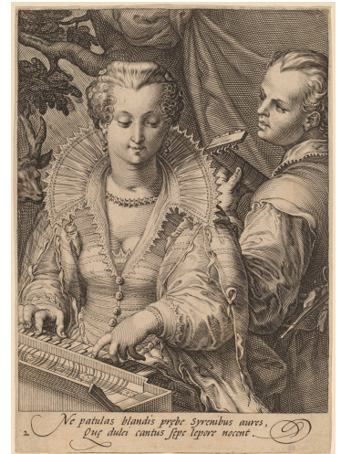
Fig 10. Jan Saenredam after Hendrick Goltzius, The Sense of Hearing , ca. 1595, engraving, 173 x 123 mm, National Gallery of Art, Washington D.C., Rosenwald Collection, 1943.3.4640