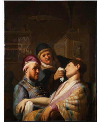
Fig 7. Rembrandt van Rijn, Unconscious Patient (Allegory of Smell) , RR-111, with eighteenth-century addition (after restoration)

Three Musicians (Allegory of Hearing) similarly depicts an evening scene, but in this instance one illuminated by an unseen light source. In this joyful image, two elderly singers, one male and one female, are joined by a young man who peers down over their shoulders at the large open music