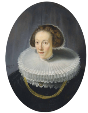
Fig 14. Rembrandt van Rijn, Portrait of Petronella Buys (1605–1670), 1635, oil on oval panel, 79.5 x 59.3 cm, The Leiden Collection, New York, inv. no. RR-115.