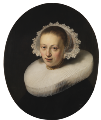
Fig 3. Rembrandt van Rijn, Portrait of a Young Woman (“ The Middendorp Rembrandt ”), 1633, oil on oval panel, 62.4 x 50.4 cm, The Leiden Collection, New York, inv. no. RR-126.