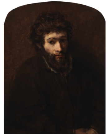
Fig 11. Rembrandt van Rijn, Bust of a Young Bearded Man , ca. 1656–58, oil on panel, 40.4 x 31.3 cm, The Leiden Collection, New York, inv. no. RR-117.