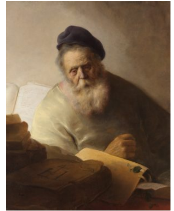
Fig 7. Jan Lievens, Bookkeeper at His Desk , ca. 1627, oil on panel, 89.7 x 72.7 cm, The Leiden Collection, New York, inv. no. JL-101.

Both monograms and names written out in full can be found in signed works of art by Rembrandt’s teachers, as well as by his Leiden companion Jan Lievens. Only a few paintings by his first teacher, Jacob Isaacs van Swanenburgh (1571–1638), are known, three of which are signed—one with the monogram “IVS” and two with his full name. Based on this modest number, little can be said about his signatures. This is not the case, however, with Rembrandt’s second teacher, Pieter Lastman (1583–1633), who frequently signed his paintings with his monogram, “PL,” or his signature, either “Pietro Lastman” or “PLastman,” as found in David Gives Uriah a Letter for Joab in The Leiden Collection (fig 6). Dated works by Lastman indicate that he alternated between monogramming and signing. In his younger years, Jan Lievens, who also studied under Lastman, signed his paintings considerably less often than Rembrandt did. While