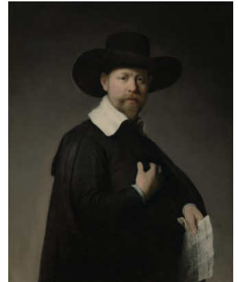
Fig 1. Rembrandt van Rijn, Portrait of Marten Looten , 1632, oil on panel, 92.71 x 76.2 cm, Los Angeles County Museum of Art, inv. no. 53.50.

A person’s identity is determined by various factors, for example their place of origin or profession. A name also contributes greatly to an individual’s identity. Until the beginning of the seventeenth century, many people in the Dutch Republic used their baptismal name in combination with a patronymic, formed from the father’s forename followed by “son” or “daughter.” For men, once they became employed, it was customary to add their professional designation. In the 1600s, the use of surnames steadily became more popular, as individuals adopted the name of their place or region of origin or that of their occupation. Some surnames, particularly those related to place of origin, were added by later commentators to help identify particular individuals. For example, in 1604, Karel van Mander (1548–1606) used the name Lucas van Leyden