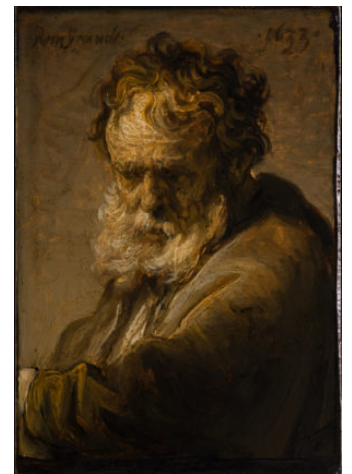
Fig 5. Rembrandt van Rijn, Bust of a Bearded Old Man , 1633, oil on paper, mounted on panel, 10.6 x 7.2 cm, The Leiden Collection, New York, inv. no. RR-116.