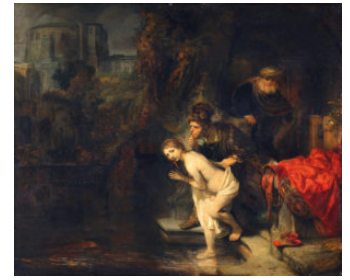
Fig 13. Rembrandt van Rijn, Susanna and the Elders , 1647, oil on panel, 76.6 x 92.8 cm, Staatliche Museen zu Berlin, Gemäldegalerie, inv. no. 828E.