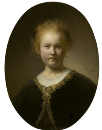
Fig 2. Rembrandt van Rijn, Young Girl in a Gold-Trimmed Cloak , 1635, oil on canvas, 138 x 116.5 cm, The Leiden Collection, New York, inv. no. RR-104.