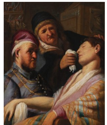
Fig 9. Rembrandt van Rijn, Unconscious Patient (Allegory of Smell) , ca. 1624–25, oil on panel, inset into an 18th-century panel, 21.5 x 17.7 cm (31.8 x 25.4 cm with 18th-century additions), The Leiden Collection, New York, inv. no. RR-111.