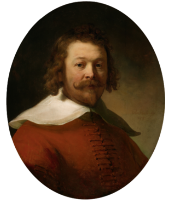
Fig 4. Rembrandt van Rijn, Portrait of a Man in a Red Coat , 1633, oil on oval panel, 63.7 x 50.8 cm, The Leiden Collection, New York, inv. no. RR-108.