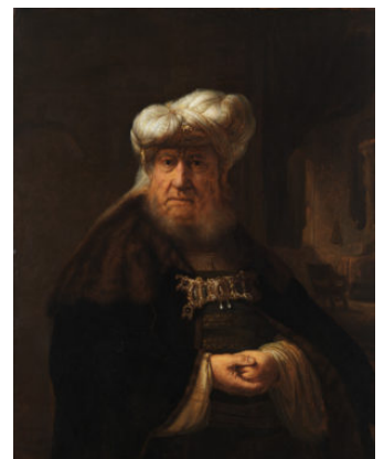
Fig 12. Workshop of Rembrandt van Rijn (possibly Ferdinand Bol), Man in Oriental Costume (possibly the Old Testament Patriarch Dan) , 164(1?), oil on panel, 103.1 x 83.5 cm, The Leiden Collection, New