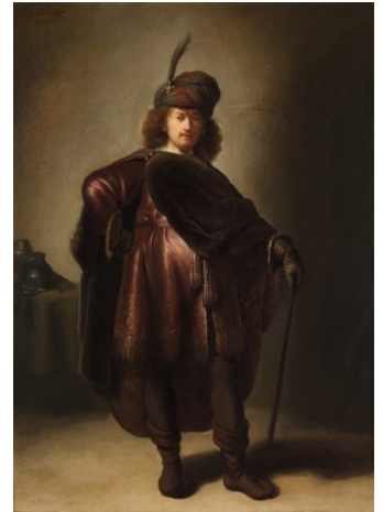
Fig 10. Isaac de Jouderville, Portrait of Rembrandt in Oriental Dress , ca. 1631, oil on panel, 70.8 x 50.5 cm, The Leiden Collection, New York, inv. no. IJ-100.

The question of why artists signed their work in the sixteenth and seventeenth centuries