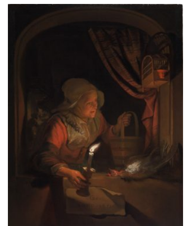
Fig 13. Gerrit Dou, Old Woman at a Window with a Candle , 1671, oil