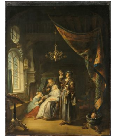
Fig 9. Gerrit Dou, The Dropsical Woman , 1663, oil on panel, 86 x 68 cm, Musée du Louvre, Paris, inv. no. 1213, © Musée du Louvre, Dist. RMN-Grand Palais / Adrien Didierjean / Art Resource, NY.

oval silver-copper alloy, 10.2 x 8.2 cm, The Leiden Collection, New York, inv. no. GD-111.