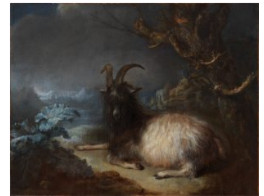
Fig 14. Gerrit Dou, Goat in a Landscape , ca. 1660–65, oil on panel, 19.6 x 24.9 cm, The Leiden Collection, New York, inv. no. GD-114.

on panel, 26.5 x 20.5 cm, The Leiden Collection, New York, inv. no. GD-103.