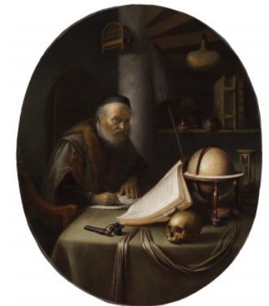
Fig 7. Gerrit Dou, Scholar Interrupted at His Writing , ca. 1635, oil on oval panel, 24.5 x 20 cm, The Leiden Collection, New York, inv. no. GD-102.