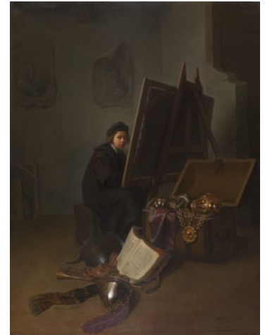
Fig 1. Attributed to Gerrit Dou, Self-Portrait at an Easel , oil on panel, 66.6 x 50.9 cm, The Leiden Collection, New York, inv. no. GD-112.