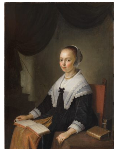
Fig 2. Gerrit Dou, Portrait of a Lady, Seated with a Music Book on her Lap , ca. 1640–44, oil on panel, 27.2 x 20 cm, The Leiden Collection, New York, inv. no. GD-116.