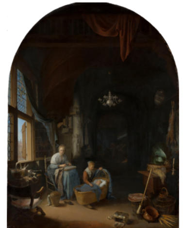
Fig 3. Gerrit Dou, The Young Mother , 1658, oil on panel, 73.5 cm x 55.5 cm, Mauritshuis, The Hague, inv. no. 32.