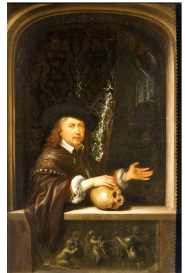
Fig 15. Gerrit Dou, Self-Portrait , 1658, oil on panel, 49.2 x 33.9 cm, Gallery Uffizi, Florence, inv. no. 1882.