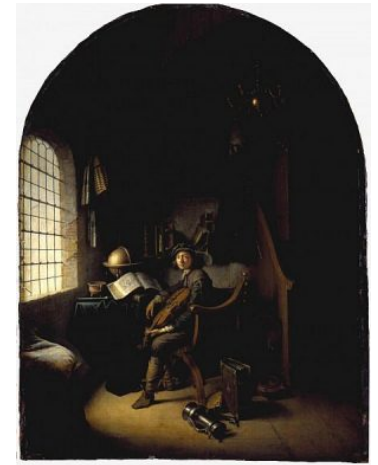
Fig 6. Gerrit Dou, An Interior with Young Violinist , 1637, oil on panel with arched top, 78.9 x 60.2 cm, Scottish National Gallery, Edinburgh, inv. no. NG. 2420