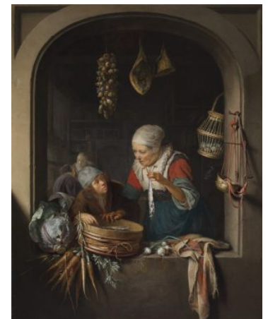
Fig 12. Gerrit Dou, Herring Seller and Boy , ca. 1664, oil on panel, 43.5 x 34.5 cm, The Leiden Collection, New York, inv. no. GD-106.