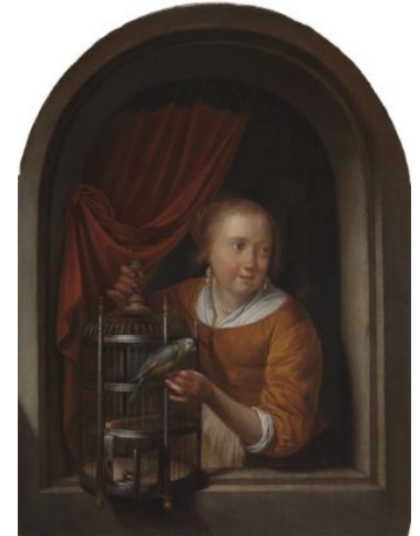
Fig 11. Gerrit Dou, Young Woman in a Niche with a Parrot and a Cage , ca. 1660–65, oil on panel, 24.8 x 18.4 cm, The Leiden Collection, New York, inv. no. GD-105.

Although most of these prices and valuations are lower than what Sandrart quoted, they are still very high compared to what Dou's colleagues charged. Nevertheless, some archival records assign much lower prices to Dou's work. For example, the painting owned by Justus de la Grange was worth a mere 10 guilders, and De Renialme had two relatively inexpensive paintings worth 30 and 40 guilders. Given Dou's working method and generally high prices, however, it is likely that these were copies or works by followers. A lack of expertise on the part of the appraisers may also have played a role here. A fascinating case study in this respect is the estate of Jan Rouyer. The appraisal of his paintings by Santvoort and Hondecoeter had been preceded by another one, done by two second-hand goods dealers. Whereas Santvoort and Hondecoeter assigned values of 450, 200, 150, and 100 guilders to the four works by Dou, the earlier estimates had been only 40, 35, 25, and 18 guilders, respectively—a discrepancy of 782 guilders! The unduly low appraisal by the second-hand goods dealers is undoubtedly related to the small format of Dou's works, as the size of a painting was an important, though by no means the only, factor in determining its value. [25]