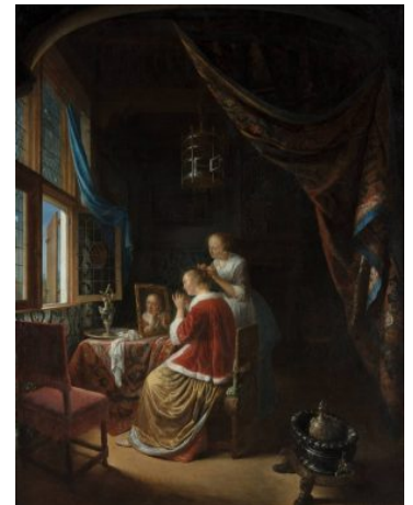
Fig 4. Gerrit Dou, A Young Woman at Her Toilet , 1667, oil on panel, 58 x 75.5 cm, Museum Boijmans Van Beuningen, Rotterdam, inv. no. 1186 (OK).