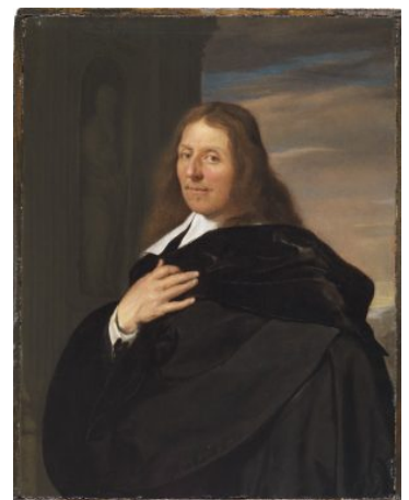
Fig 6. Frans van Mieris, Portrait of a Fifty-Two Year Old Man , 1665, oil on panel, 19.2 x 15 cm, The Leiden Collection, New York, inv.