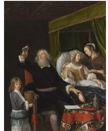
Fig 16. Jacob Toorenvliet, Doctor's Visit , ca. 1666–67, oil on copper, 52.3 x 41.3 cm, The Leiden Collection, New York, inv. no. JT-102.

Nevertheless, the work of these artists probably found greater favor than would appear from the inventories. For instance, in the above-mentioned manuscript, Van Staveren is glossed as follows: "men hier te lande [pleeg] veele fraaijen stukjes van hem te zien, waar in men zeijde dat zijn meester [= Dou] de laatste hand zoude gelegd hebben" (one was wont to say that they had seen many beautiful pieces by him in this country, to which it was said that his master [Dou] had put the finishing touches). However, "[d]e konsthendelaars hebben de meesten en besten (...) al overlang opgekogt en buitenlands voor schilderijen van Douw verkogt" (the art dealers had already long ago bought up the most and best of them [...] and sold them abroad as paintings by Dou). This situation applied to Van Spreeuwen as well, of whom "[m]en zegt, dat er hier te lande stukjes van hem plegen te zijn, die zeer na by die van zijn meester kwamen, en door handelaars naar elders gevoerd zijnde, voor die van Douw zouden verkogt zijn" (it is said that in this country there are pieces that come very close to those by his master, which having been shipped elsewhere by dealers are apparently sold as being by Dou). [32] The actions of these art dealers may explain why few works by these painters are found in the Netherlands. It also seems plausible