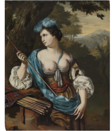
Fig 19. Willem van Mieris, Diana, Goddess of the Hunt , 1686, oil on panel, 18 x 14.4 cm, The Leiden Collection, New York, inv. no. WM-101.

Leiden Collection, New York, inv. no. JT-107.