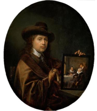
Fig 4. Gerrit Dou, Self-Portrait Holding a Portrait of His Parents and Brother , ca. 1649, oil on oval panel, 27 x 23 cm, Herzog Anton Ulrich-Museum, Braunschweig, inv. no. GG 303.

Leiden painters found their most important new patrons among burghers,