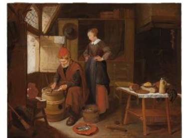
Fig 12. Quiringh van Brekelenkam, Fisherman and His Wife in an Interior , 1657, oil on panel, 47 x 60.3 cm, The Leiden Collection, New York, inv. no. QB-100.