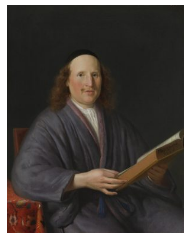
Fig 15. Pieter Cornelisz van Slingeland, Portrait of a Man Reading a Book , 1668, oil on copper, 16.2 x 12.6 cm, The Leiden Collection, New York, inv. no. PVS-100.