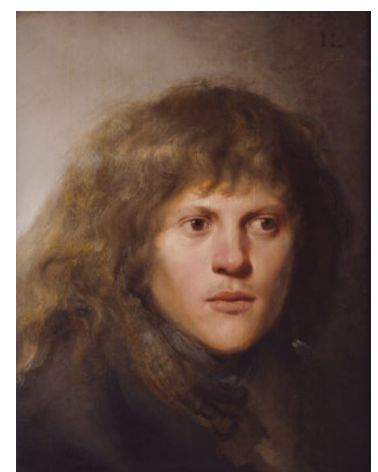
Fig 3. Jan Lievens, Self-Portrait , ca. 1629–30, oil on panel, 42 x 37 cm, The Leiden Collection New York, inv. no. JL-105.