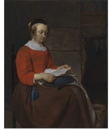
Fig 13. Gabriel Metsu, Young Woman Seated in an Interior, Reading a Letter , ca. 1658–61, oil on panel, 25.8 x 21 cm, The Leiden Collection, New York, inv. no. GM-103.

Van Spreeuwen is mentioned but 15 times, while Van Egmond's name appears only 7 times. Koedijck's name is missing entirely; not only in Leiden, but also in Amsterdam, where he probably spent more time between