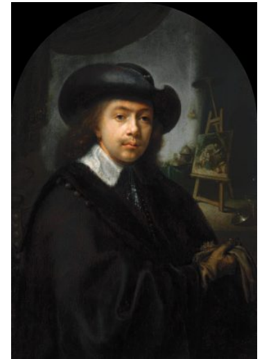
Fig 7. Gerrit Dou, Self-Portrait , ca. 1645, oil on panel with arched top, 12.4 x 8.3 cm, Kremer Collection.