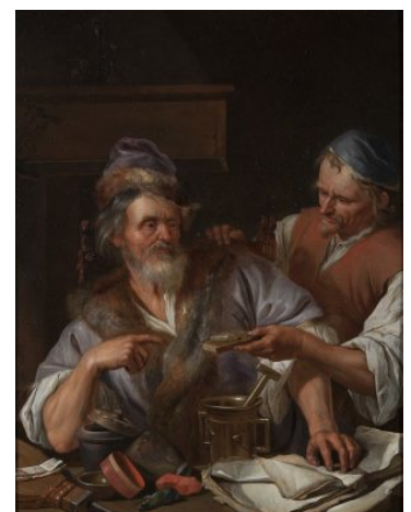
Fig 18. Jacob Toorenvliet, Alchemist , 1684, oil on copper, 31.6 x 25.3 cm, The