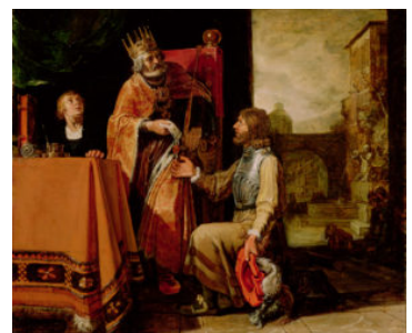
Fig 4. Pieter Lastman, King David Handing the Letter to Uriah , 1611, oil on panel, 51.1 x 61.3 cm, Detroit Institute of Arts, inv. no. 60.63, Detroit Institute of Arts.