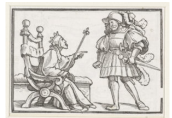
Fig 2. Hans Holbein, David and Uriah , 1538, woodcut, 60 x 85 mm, Rijksprentenkabinet, Amsterdam, inv. no. RP-P-OB-4511S(R).