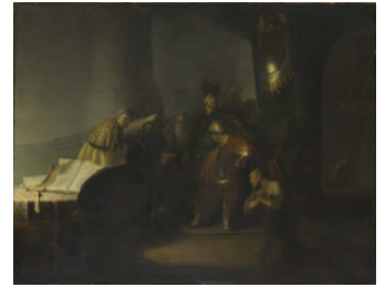
Fig 5. Rembrandt van Rijn, Judas Returning the Thirty Pieces of Silver , 1629, oil on panel, 79 x 102.3 cm, Private Collection.

These broader circumstances laid the groundwork for a new approach to history painting in the early decades of the seventeenth century. For Lastman, this meant turning away from the exaggerated expressions of Mannerism that had dominated history painting at the end of the sixteenth century—large-scale works, often with nude figures in active poses—and toward the depiction of biblical and profane themes with small, multifigure compositions, often set into landscapes, with “historical” details. Orientalizing motifs, for instance, were intended to situate biblical scenes in a context that resembled the holy land. [19] A group of contemporaries in Amsterdam, including Claes Cornelisz Moeyaert (1591–1655), Jan (1581/82–1630) and Jacob Pynas