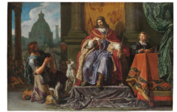
Fig 1. Pieter Lastman, David Gives Uriah a Letter for Joab , 1619, oil on panel, 42.8 x 63.3 cm, The Leiden Collection, New York, inv. no. PL-100.

This essay explores key aspects of Lastman's approach to history painting through the lens of David Gives Uriah a Letter for Joab . It addresses some of Lastman's central concerns as a history painter in seventeenth-century Amsterdam as well as the pictorial implications his narrative and stylistic choices had for Dutch history painting. [8] More specifically, it examines the artist's interest in portraying a moment of intense inner conflict and demonstrates how his knowledge of antique visual and textual sources, along with contemporary cultural and intellectual traditions, impacted his storytelling. [9] Exploring these issues provides insight into Lastman's ingenuity as a painter and offers a broader perspective on his place within The Leiden Collection.