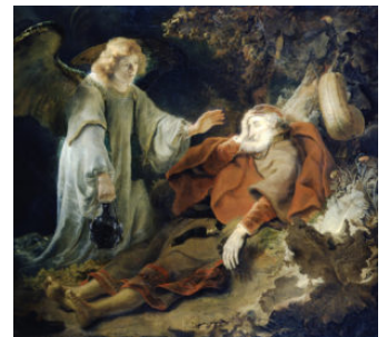
Fig 6. Ferdinand Bol, Angel Appearing to Elijah , ca. 1642, oil on canvas, 162.6 x 177.8 cm, The Leiden Collection, New York, FB-104.