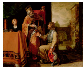
Fig 4. Pieter Lastman, King David Handing the Letter to Uriah , 1611, oil on panel, 51.1 x 61.3 cm, Detroit Institute of Arts, inv. no. 60.63, Detroit Institute of Arts, USA Founders Society purchase and Dexter M. Ferry Jr. Fund / Bridgeman Images.