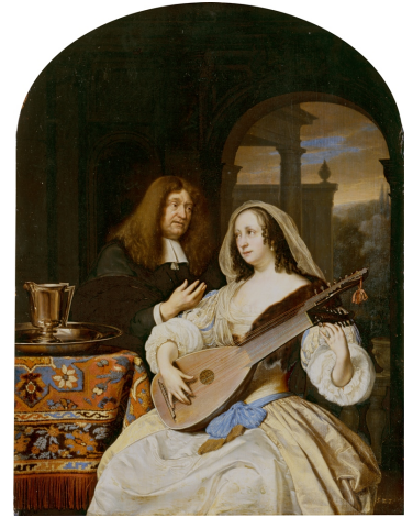
Fig 12. Frans van Mieris the Elder, Double Portrait of Franciscus de le Boë Sylvius and His Wife , known as “The Music Lesson,” 1672, panel with arched top, 41 x 31 cm, Staatliche Kunstsammlungen, Gemäldegalerie Alte Meister, Dresden, 1743

Patronage involved more than buying works of art; there were other ways of promoting one’s protégé. For instance, Sylvius ensured that Van Mieris