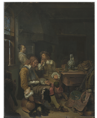
Fig 9. Frans van Mieris the Elder,