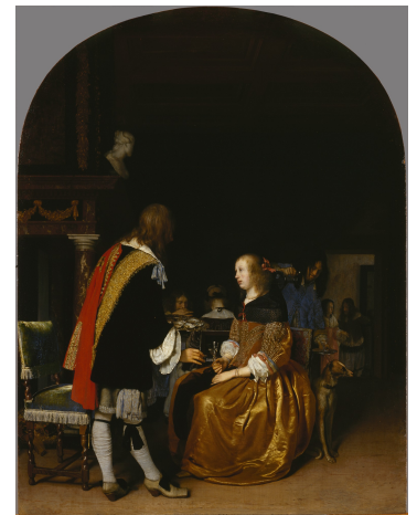
Fig 8. Frans van Mieris the Elder, The Oyster Meal , 1659, oil on panel, 44.5 x 34.5 cm, The State Hermitage Museum, St. Petersburg, ГЭ-917