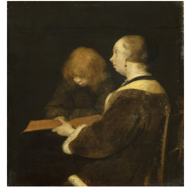
Fig 7. Gerard ter Borch, The Reading Lesson, ca. 1652, oil on panel, 27 x 25 cm, Musée du Louvre, Paris, Département des Peintures, Bequest of Louis La Caze, 1869, MI 1006