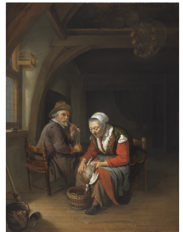
Fig 2. Frans van Mieris the Elder, Elderly Couple in an Interior , FM-100