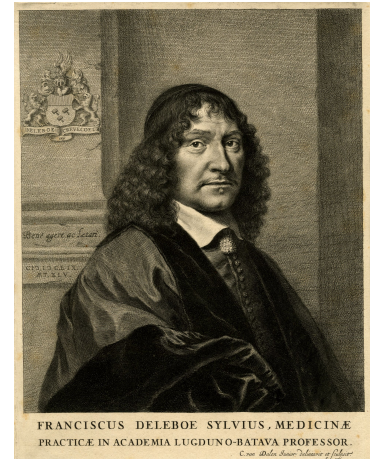
Fig 10. Cornelis van Dalen, Portrait of Franciscus de le Boë Sylvius , 1659, engraving (fourth state), 306 x 238 mm, British Museum, London, 1864,0714.17, © Trustees of the British Museum

Sleeping Officer in an Inn , ca. 1666, oil on panel, 42.5 x 33 cm, Alte Pinakothek, Bayerische Staatsgemäldesammlungen, Munich, Inv. Nr. 241. Photo Credit: bpk, Berlin / Art Resource, NY