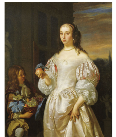
Fig 16. Frans van Mieris the Elder, Portrait of Agatha Paets , 1665, oil on panel, 27 x 21.5 cm, private collection, United States