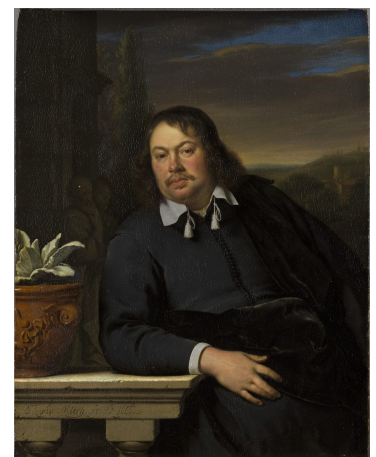
Fig 11. Frans van Mieris the Elder, Portrait of Florentius Schuyt (1619–1669), 1666, oil on copper, on panel, 21.3 x 16.5 cm, Royal Picture Gallery Mauritshuis, The Hague