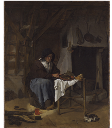
Fig 4. Gabriel Metsu, Old Woman at Her Meal in an Interior , GM-102

Van Mieris was one of the best-paid painters in the Dutch Republic. Attestations of this fact are found primarily in literary sources, and they generally touch on the exorbitant amounts that foreign princes were willing to pay for his work. These were often substantially higher than the valuations given in the estate inventories of burghers and dealers. [13] Of the more than 750 paintings evaluated in the 258 Leiden estate inventories, only 22 were worth 100 or more guilders. Of this modest number, 15 works—including the three most valuable ones, all by Van