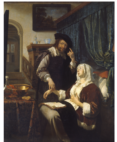
Fig 5. Frans van Mieris the Elder, The Doctor's Visit , 1657, oil on panel, 34 x 27 cm., Kunsthistorisches Museum, Vienna