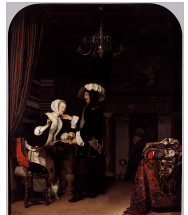
Fig 13. Frans van Mieris the Elder, The Cloth Shop , 1660, oil on panel, 55 x 43 cm, Kunsthistorisches Museum, Vienna