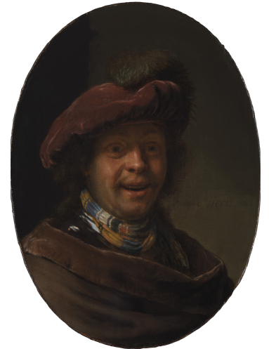
Fig 15. Frans van Mieris the Elder, “Self-Portrait” with a Plumed Beret, FM-108