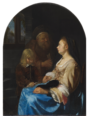
Fig 6. Frans van Mieris the Elder, Child's Lesson , FM-102