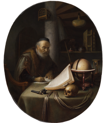
Fig 7. Gerrit Dou, Scholar Interrupted at His Writing , GD-102

panel, arched top, 78.9 x 60.2 cm, National Gallery of Scotland, Edinburgh, inv. NG 2420