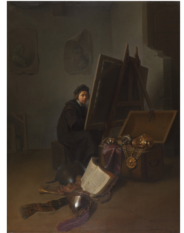
Fig 1. Attributed to Gerrit Dou, Self-Portrait at an Easel , GD-112