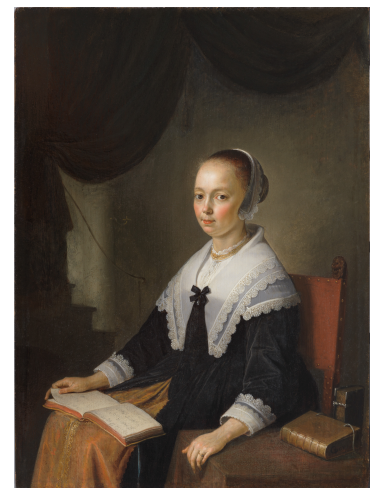
Fig 2. Gerrit Dou, Portrait of a Lady, Seated with a Music Book on her Lap , GD-116