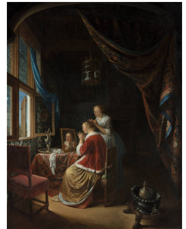
Fig 4. Gerrit Dou, A Young Woman at Her Toilet , 1666, oil on panel, 58 x 75.5 cm, Museum Boijmans Van Beuningen, Rotterdam, inv. no. 1186 (OK)