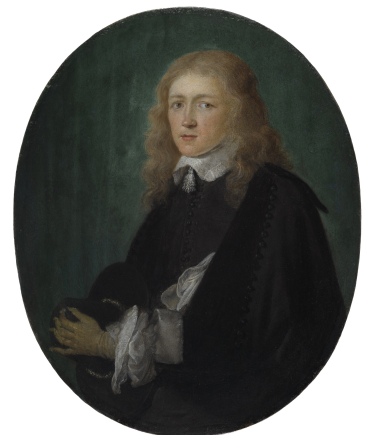
Fig 8. Gerrit Dou, Portrait of Dirck van Beresteyn , GD-111