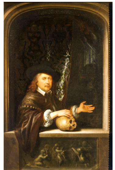
Fig 15. Gerrit Dou, Self-Portrait , 1658, oil on panel, 52 x 40 cm, Uffizi Galleria degli Uffizi, Florence