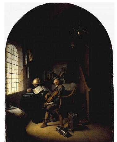
Fig 6. Gerrit Dou, An Interior with Young Violinist , 1637, oil on panel