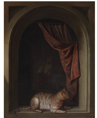
Fig 10. Gerrit Dou, Cat Crouching on the Ledge of an Artist's Atelier , GD-108