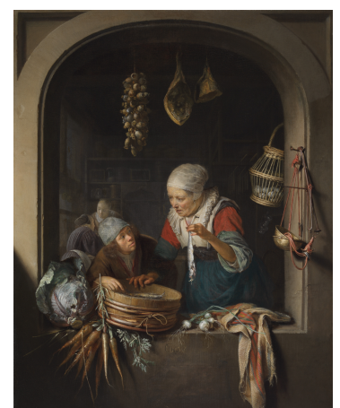
Fig 12. Gerrit Dou, Herring Seller and Boy , GD-106