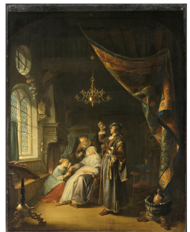
Fig 9. Gerrit Dou, The Dropsical Woman , 1663, oil on wood, 85 x 67 cm, Musée du Louvre, Paris, inv. 1212, © Musée du Louvre,