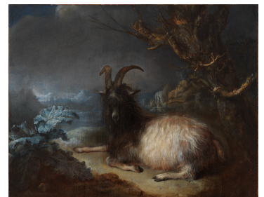
Fig 14. Gerrit Dou, Goat in a Landscape , GD-114