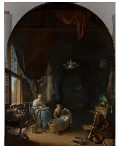
Fig 3. Gerrit Dou, The Young Mother , 1658, oil on panel, 73.5 cm x 55.5 cm, Royal Picture Gallery Mauritshuis, The Hague,