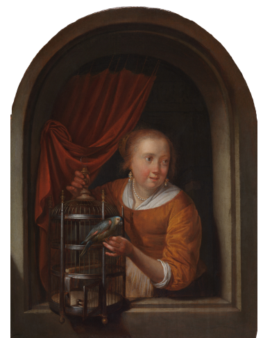
Fig 11. Gerrit Dou, Young Woman in a Niche with a Parrot and a Cage , GD-105