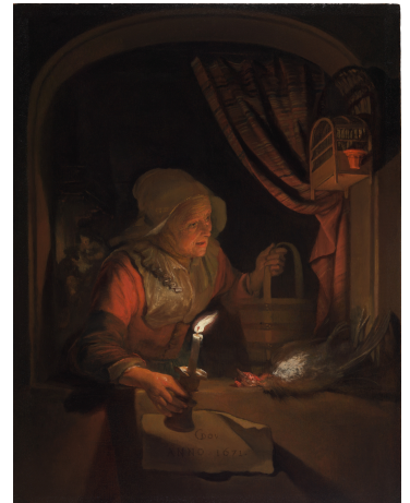
Fig 13. Gerrit Dou, Old Woman at a Window with a Candle , GD-103

Although most of these prices and valuations are lower than what Sandrart quoted, they are still very high compared to what Dou’s colleagues charged. Nevertheless, some archival records assign much lower prices to Dou’s work. For example, the painting owned by Justus de la Grange was worth a mere 10 guilders, and De Renialme had two relatively inexpensive