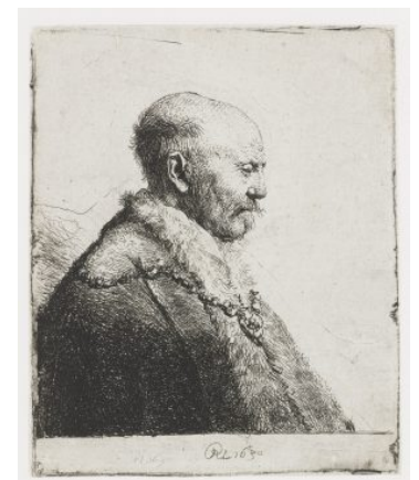
Fig 3. Rembrandt van Rijn, Bust of an Old man , 1630, etching, 11.8 x 9.7 cm, Rijksprentenkabinet RP-P-OB-590