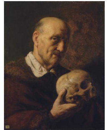
Fig 5. Jan Lievens, An Old Man Holding a Skull , ca. 1625–30, oil on panel, 61.6 x 48.3 cm, private collection