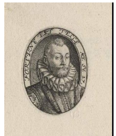
Fig 6. Hendrick Goltzius, Jan van Heussen at the Age of 27 , ca. 1581, engraving, 4.8 x 3.5 cm, Fitzwilliam Museum, Cambridge, inv. P.7330-R, Hollstein (English) H 196