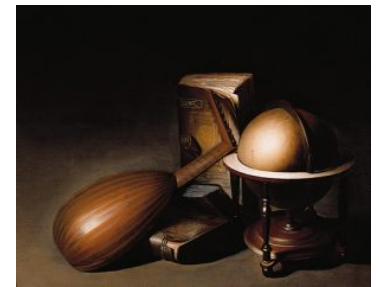
Fig 2. Gerrit Dou, Still Life with Globe, Lute, and Books , ca. 1635, oil on panel, 22.5 x 30 cm, private collection, Montreal