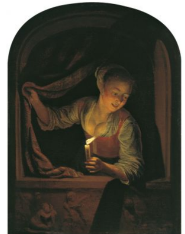
Fig 1. Gerrit Dou, Young Woman with a Lighted Candle at a Window, ca. 1658–65, oil on panel, 26.7 x 19.5 cm, Museo Thyssen-Bornemisza, Madrid, inv. no. 132 (1930.21)