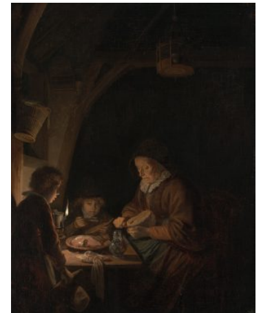
Fig 4. Gerrit Dou, Old Woman with Two Young Children , ca. 1655–66, oil on panel, 28 x 22 cm, Museum of Fine Arts, Boston, inv. no. 2003.71, Photograph ©2017 Museum of Fine Arts, Boston