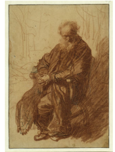
Fig 1. Rembrandt van Rijn, Old Man Seated with Folded Hands , ca. 1631, black and red chalk on reddish-yellow washed paper, incised, 226 x 157 mm, Kupferstichkabinett, Staatliche Museen, Berlin, Germany, inv. no. KDZ 1151, bpk Bildagentur / Kupferstichkabinett, Staatliche Museen / Art Resource, NY.