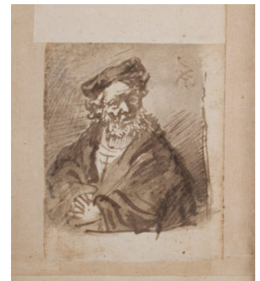
Fig 4. Rembrandt van Rijn, Drawing from Album amicorum II van Burchard Grossman , 1634, pen and brown ink with wash, 89 x 71 mm, Koninklijke Bibliotheek, National Library of the Netherlands, The Hague.