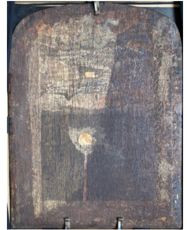
Fig 6. Rembrandt van Rijn, verso of Bust of a Young Bearded Man , ca. 1656–58, oil on panel with arched top, 40.4 x 31.3 cm, The Leiden Collection, New York, inv. no. RR-117.

This prompts a fascinating question: What was the original size and shape of the panel, and how might this change have affected the appearance of the sitter? While concrete conclusions remain elusive, certain hypotheses can be advanced. The sitter would not have been positioned centrally in the picture plane but instead situated somewhat to the left, as is often seen in Rembrandt's portraits from this period of his career (fig 4). This arrangement would have opened the composition to the right, creating a greater sense of movement in the young man's pose. The angle of his body,