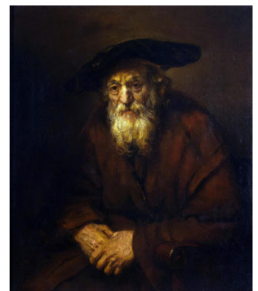
Fig 8. Rembrandt van Rijn, Portrait of an Old Jew , 1654, oil on canvas, 109 x 85 cm, Hermitage, Saint Petersburg.