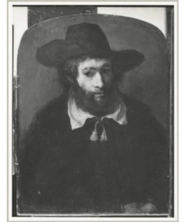
Fig 3. Rembrandt van Rijn, Bust of a Young Bearded Man (with eighteenth-century overpaint), ca. 1656–58, oil on panel with arched top, 40.4 x 31.3 cm, The Leiden Collection, New York, inv. no. RR-117.

Sheldon rightly observed in this painting many close similarities to Rembrandt’s “tricks in the handling of paint . . . [including] contrasts of thickness and thinness, warmth and coolness, fluidity and dryness, transparency, and opacity.” [12] She emphasized the complex makeup of the paint that included a wide range of bright