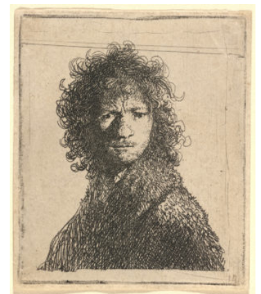
Fig 7. Rembrandt van Rijn, Self-Portrait, Frowning, 1630, etching on laid paper, 76 x 65 mm, National Gallery of Art, Washington, D.C., Rosenwald Collection, inv. no. 1943.3.7051