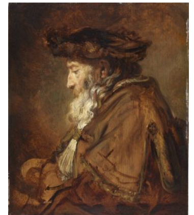
Fig 2. Rembrandt van Rijn, Portrait of an Old Man (Possibly a Rabbi) , ca. 1645, oil on panel, 22.2 x 18.4 cm, The Leiden Collection, New York, inv. no. RR-109.