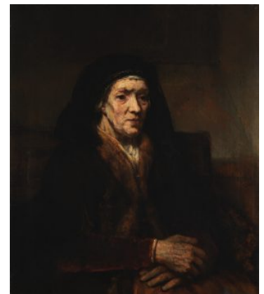
Fig 4. Rembrandt van Rijn, Portrait of a Seated Woman with Her Hands Clasped , 1660, oil on canvas, 77.5 x 64.8 cm, The Leiden Collection, New York, inv. no. RR-113.