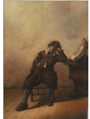
Fig 4. Pieter Codde, A Student Smoking a Pipe , ca. 1630, oil on panel, 46.2 × 33.4 cm, Palais des Beaux-Arts, Lille, Don Antoine Brasseur, 1885, inv. P. 240

The similarity of the monogram in the Leiden Collection painting appears to provide strong evidence of a common but as of yet unidentified artist. Nevertheless, caution about making that association is still necessary because the appearance of these two paintings is so different. [8] The Lille painting exhibits breathtaking coloristic sophistication, with controlled contrasts of cool and warm hues, quite different from the overall grayish cast of the Leiden Collection painting. The pulsating rhythms in the Lille painting, generated by bulky fabric forms and striking curved and angular contours, find no parallel in the stark image of Bust of an Old Woman , which depends more closely on Rembrandt's models. The possibility of a workshop connection between the Lille and Leiden Collection paintings—of master and pupil for instance—might explain the shared monogram, but such a hypothesis remains purely speculative.