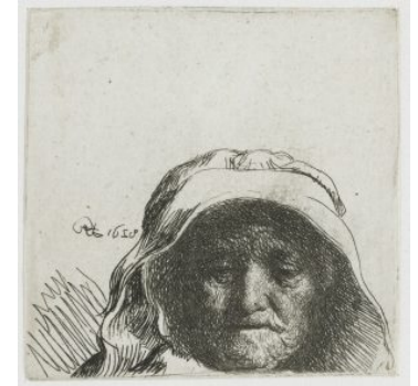
Fig 1. Rembrandt van Rijn, Head of an Old Woman with a Cap , 1628, etching, state 2 of 2, 63 x 64 mm, Rijksprentenkabinet, Rijksmuseum, Amsterdam, inv. no. RP-P-1961-1195