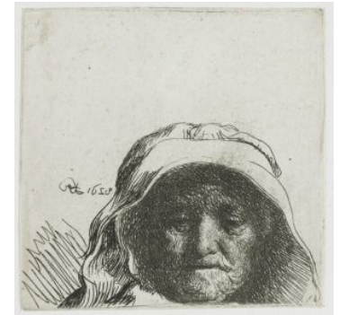
Fig 1. Rembrandt van Rijn, Head of an Old Woman with a Cap , 1628, etching, state 2 of 2, 63 x 64 mm, Rijksprentenkabinet, Rijksmuseum, Amsterdam, inv. no. RP-P-1961-1195