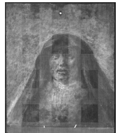
Fig 2. X-radiograph of Bust of an Old Woman , RR-122