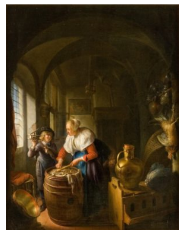
Fig 12. Gerrit Dou, The Mousetrap , ca. 1650, oil on panel, 47 x 36 cm, Musée Fabre, Montpellier, © Musée Fabre — Montpellier Agglomération / cliché F. Jaulmes