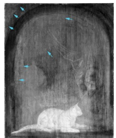
Fig 6. Infrared photograph of Cat Crouching on the Ledge of an Artist's Atelier , GD-108