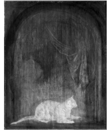
Fig 7. Infrared photograph superimposed on X-radiograph with inverted density grayscale of Cat Crouching on the Ledge of an Artist's Atelier , GD-108 (composite: John Twilley)