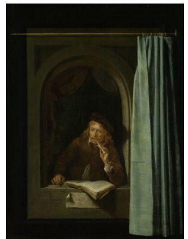
Fig 11. Gerrit Dou, Painter with Pipe and Book , ca. 1645, oil on panel, 48 x 37 cm, Rijksmuseum, Amsterdam, SK-A-86