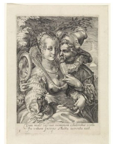
Fig 9. Jan Saenredam, after Hendrick Goltzius, Sight , ca. 1595–96, engraving, 177 x 124 mm, Rijksprentenkabinet, Rijksmuseum, Amsterdam, RP-P-1884-A-7717