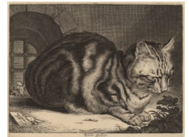
Fig 8. Cornelis Visscher, The Large Cat , ca. 1657, engraving on laid paper, 22.1 x 31.5 cm, National Gallery of Art, Washington D.C., Ailsa Mellon Bruce Fund, 1995.72.1