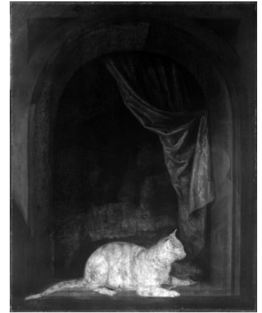
Fig 4. Infrared reflectogram of Cat Crouching on the Ledge of an Artist's Atelier , GD-108

The prominent red curtain, beautifully depicted with subtle violet highlights shimmering in the cascading of light across the iridescent fabric, also relates to the painting's underlying concern for the interrelationship of illusion and reality. The depiction of such a dazzling curtain evokes the famous story