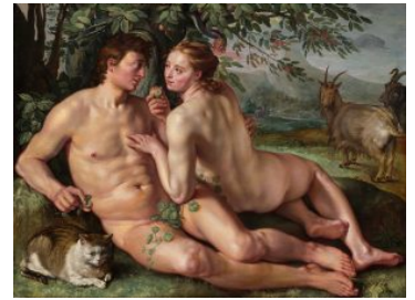
Fig 10. Hendrick Goltzius, Fall of Man , 1616, oil on canvas, 104.5 x 138.4 cm, National Gallery of Art, Washington D.C., Patrons' Permanent Fund, 1996.34.1