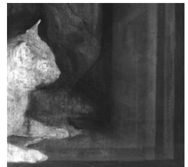
Fig 5. Detail of infrared reflectogram of Cat Crouching on the Ledge of an Artist's Atelier , GD-108, showing silhouette of what appears to be a mousetrap in the lower right corner