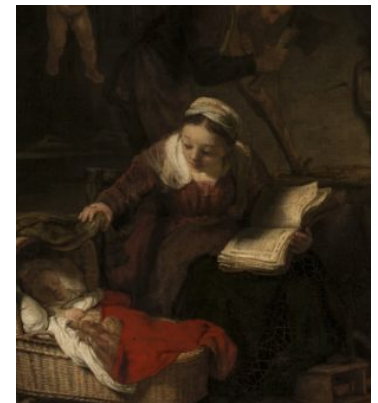
Fig 2. Detail, Rembrandt van Rijn, Holy Family , 1645, oil on canvas, 116.4 x 96.4 cm, The State Hermitage Museum, St. Petersburg, inv. 741