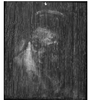
Fig 3. X-radiograph of Head of a Girl , RR-112