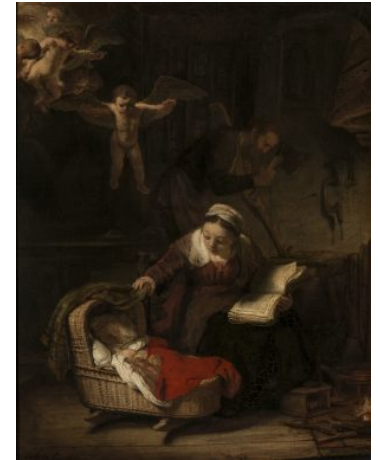
Fig 1. Rembrandt van Rijn, Holy Family , 1645, oil on canvas, 116.4 x 96.4 cm, The State Hermitage Museum, St. Petersburg, inv. 741