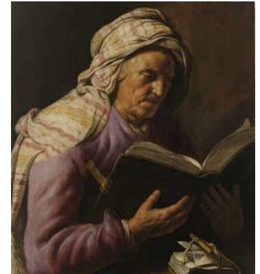
Fig 1. Jan Lievens, Old Woman Reading , ca. 1625, 81 x 69 cm, Rijksmuseum, Amsterdam, SK-A-4702