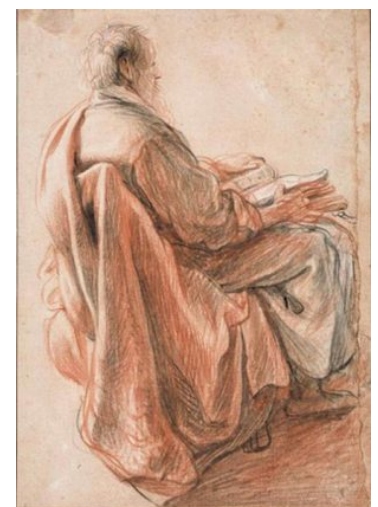
Fig 3. Rembrandt van Rijn, Seated Old Man with a Book , 1628, red and black chalk, heightened with white, on yellowish, light-brown