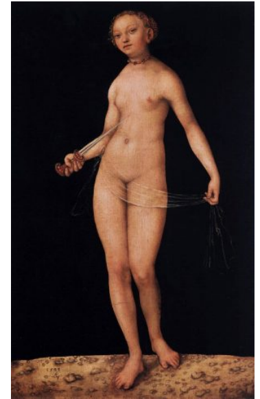
Fig 1. Lucas Cranach, Lucretia , 1533, oil on panel, 37 x 24 cm, Staatliche Museen, Berlin, Inv. No. 1832