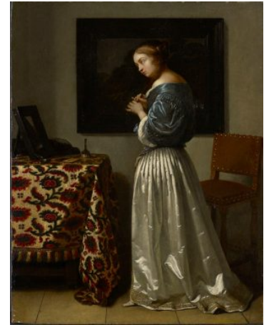
Fig 3. Caspar Netscher, Woman at Her Toilet , ca. 1665, oil on panel, 42.5 x 33 cm, Private Collection, London, courtesy Johnny Van Haeften Ltd.

Lucretia , which is in good condition, was probably painted about 1665–67. [9] The same model appears in Netscher's genre paintings of the mid-1660s (fig 3), many of which project a similar sensual and sensorial appeal. In these works, Netscher often combined discreet glimpses into private domestic worlds with a detailed attention to the tactile surfaces of fabric and flesh (see also CN-108). Were it not for Lucretia's artfully disheveled garments and the slim dagger clutched in her outstretched hand, she could easily be mistaken for one of these pampered seventeenth-century beauties. By limiting accessories to a generous swag of green drapery and a pillow hinting at the presence of a bed in the right background, Netscher avoids tying his representation to a specific time and place. Some have faulted Netscher's history paintings for lacking a certain dignified historicism; the nineteenth-century critic Charles Blanc, for example, remarked, "the notion of the antique, the sublime conventions which form the ideal in art, were too elevated for his spirit. . . . [He] did not forego [using] some pretty Hague lady as the model for his Cleopatra, or Cleopatra herself as the pretext for a beautiful satin robe." [10] Nevertheless, the very contemporaneity of Netscher's Lucretia is what contributes most significantly to her