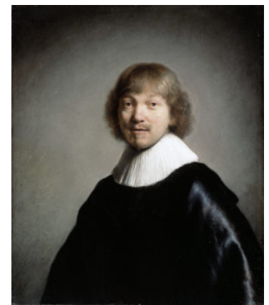
Fig 2. Rembrandt van Rijn, Portrait of Jacob de Gheyn III , 1632, oil on panel, 29.9 x 24.9 cm, Dulwich Picture Gallery, London, inv. no. DPG99