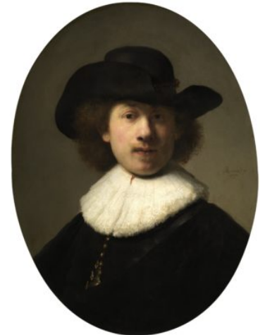
Fig 3. Rembrandt van Rijn, Self-Portrait as a Burger , 1632, oil on panel, 64.4 x 47.6 cm, The Burrell Collection, Glasgow, inv.nr. 35/600