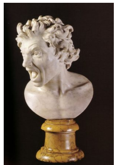
Fig 3. Gianlorenzo Bernini, The Damned Soul , 1619, marble, Palazzo di Spagna, Rome